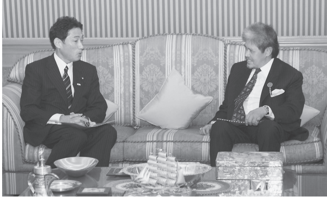
Amicable relations: H.R.H. Prince Mohamed Bolkiyah, minister of foreign affairs and trade of Brunei Darussalam, meets with Foreign Minister Fumio Kishida on Jan. 12 in Bandar Seri Begawan during Kishida's visit. Right: Kishida pays a courtesy call on H.R.H. Prince Haji Al-Muhtadee Billah, the Crown Prince.

The government of Brunei Darussalam is also investing in various activities involving non-energy related projects such as pharmaceuticals, food and food ingredients and information and communications technology. Several key industry clusters that add value to Brunei Darussalam's existing resources have also been identified and investors are invited to set up businesses in our renewable energy