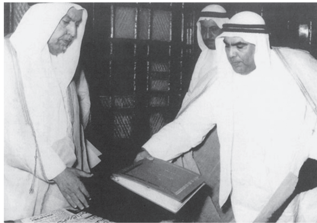
Constitutional emirate: On Nov. 11, 1962, Amir Abdullah Al-Salim Al-Sabah ratifies the draft constitution of the State of Kuwait, which would come into force on Jan. 29, 1963, when the first session of the National Assembly of Kuwait was convened. Right: Located in Kuwait City, the Kuwait National Assembly Building was designed in 1972 by Danish architect Jom Utzon, who also designed the Sydney Opera House. The National Assembly Building was completed in 1982.

With reference to the deep bilateral relations of friendship between the State of Kuwait and Japan, we recall, with all due honor and pride, the