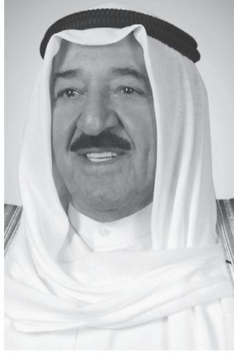
Amir of the State of Kuwait Sheikh Sabah Al-Ahmad Al-Jaber Al-Sabah

Furthermore, the State of Kuwait supports the efforts exerted by the United Nations to fight climate change through active participation in the ongoing negotiations on reducing the negative effects of this phenomenon based on the principles and provisions stipulated in the United Nations Framework Convention on Climate Change (UNFCCC) and Kyoto Protocol, and their effective and sustainable implementation, as they are considered legal tools and foundations of international collaboration on this matter, especially the principle of shared responsibility.