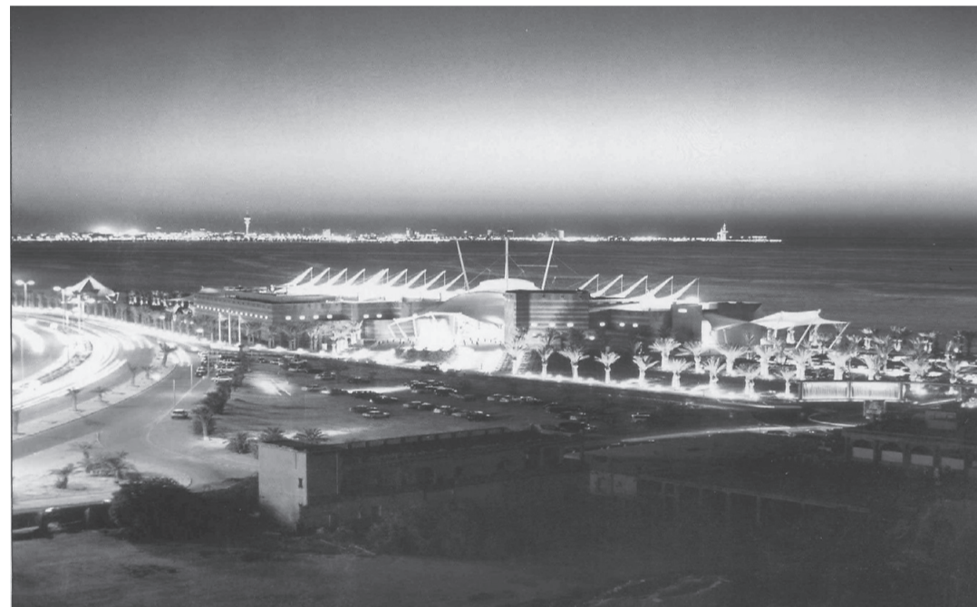
Place of learning: Located in Salmiya, the Scientific Center of Kuwait serves as an institution for environmental education of the Gulf region as well as the history of the country. It spans over 80,000 sq. meters and houses the largest aquarium in the Middle East.

Collaboration in the areas of education and culture with Japan, which has already gained