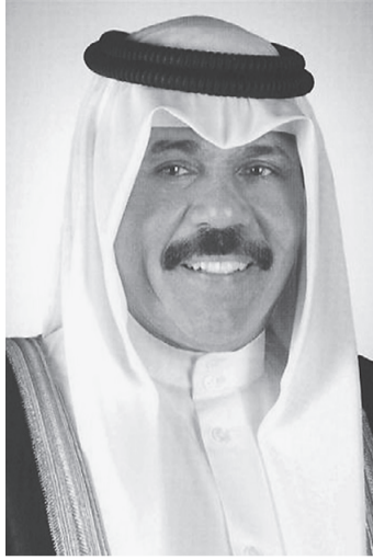
Crown Prince of the State of Kuwait Sheikh Nawaf Al-Ahmad Al-Jaber Al-Sabah

Despite being considered as a developing nation, the State of Kuwait has had a resolute standpoint since its independence in 1961, which is to pay particular