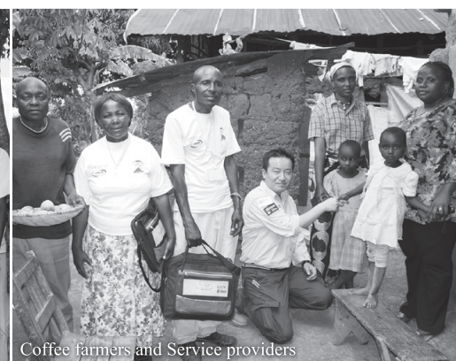
Coffee farmers and Service providers

We are proud of serving 100% pure Kilimanjaro coffee to the people through Fair Trade in Japan. In Tanzania, we've conducted the Maternal and Child Health Program to instruct family planning and sanitary care with local NGO, UMATI, since 2010.