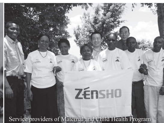
Service providers of Maternal and Child Health Program