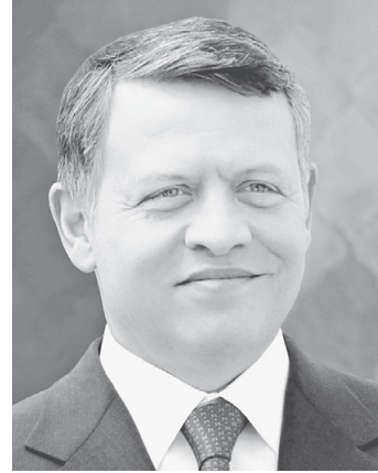
H.M. King Abdullah II Ibn Al Hussein of the Hashemite Kingdom of Jordan

a country that imports 96 percent of its energy needs into an energy-exporting country while boosting our clean and green sources such as solar, wind and peaceful nuclear power generation fueled by Jordan's wealth of uranium. It also includes regional-scale water desalination projects to solve the serious freshwater shortage in Jordan and neighboring countries powered by Jordan's new green energy, regional railway networks that connect