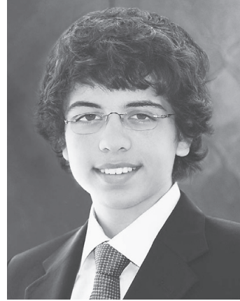
H.R.H. Crown Prince Hussein Bin Abdullah II of the Hashemite Kingdom of Jordan

Our road map for the future is clear, diverse and bullish. It includes transforming Jordan in the coming few years from