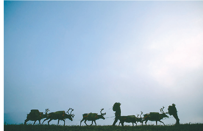
Unique: There are several "nature tourism" adventures to Lapland in which tourists can explore the Sami culture.

"Nature tourism" is one of Sweden's biggest attractions, with visitors from around the world drawn by the country's stunning nature and untouched wilderness. At the top of many travelers' wish list is Lapland, with its unique scenery and once-in-a-lifetime experiences