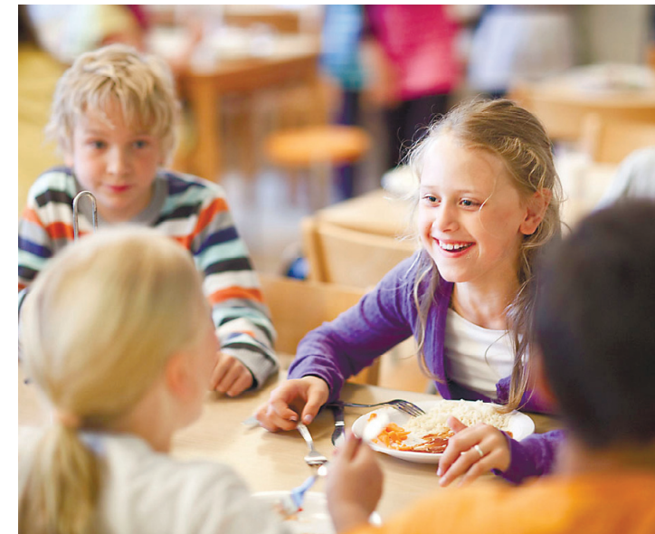
Education: All Swedish schools are required by law to provide free lunches for the students. In Sweden, free lunch has been served since the 1940s and it is an important part of the education system.

The educational system is based on tax-financed education for all, supported by publicly subsidized programs for further education, retraining, adult schools and study groups. The private business sector, meanwhile, offers an advanced system of further education and