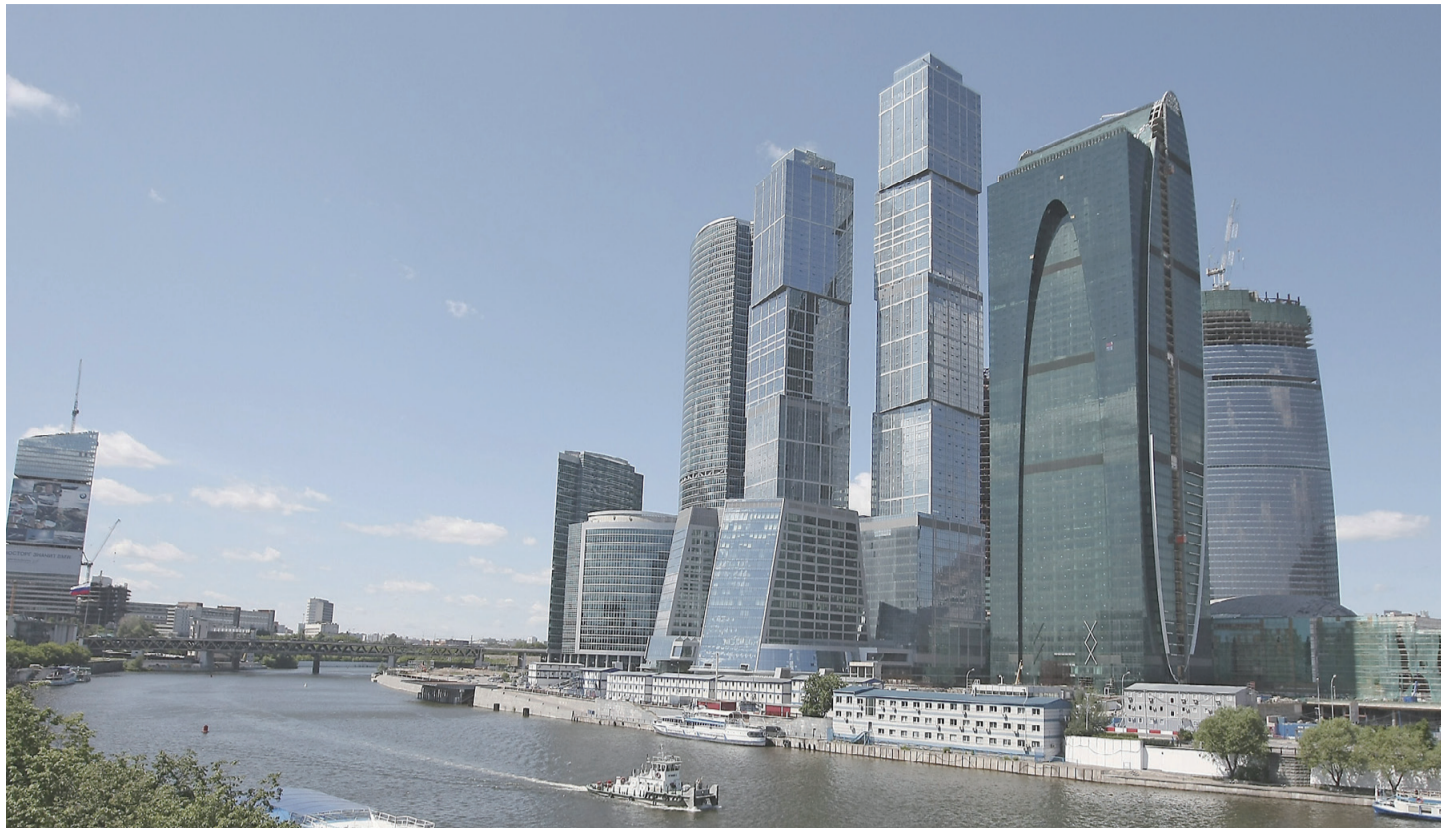
New age: A view of the Moscow International Business Center (MIBC) with its modern skyscrapers. EMBASSY OF RUSSIA