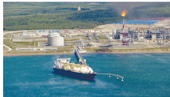
Technology and resources: Completed in 2012, the Ruskly Bridge (left) spans the Eastern Bosphorus, connecting Ruskly Island to mainland Vladivostok. Above: The tanker Cygnus Passage at the terminal for the shipment of gas at the first Russian liquefied natural gas (LNG) plant (project Sakhalin-2) in Prigorodnoye of Sakhalin Island.