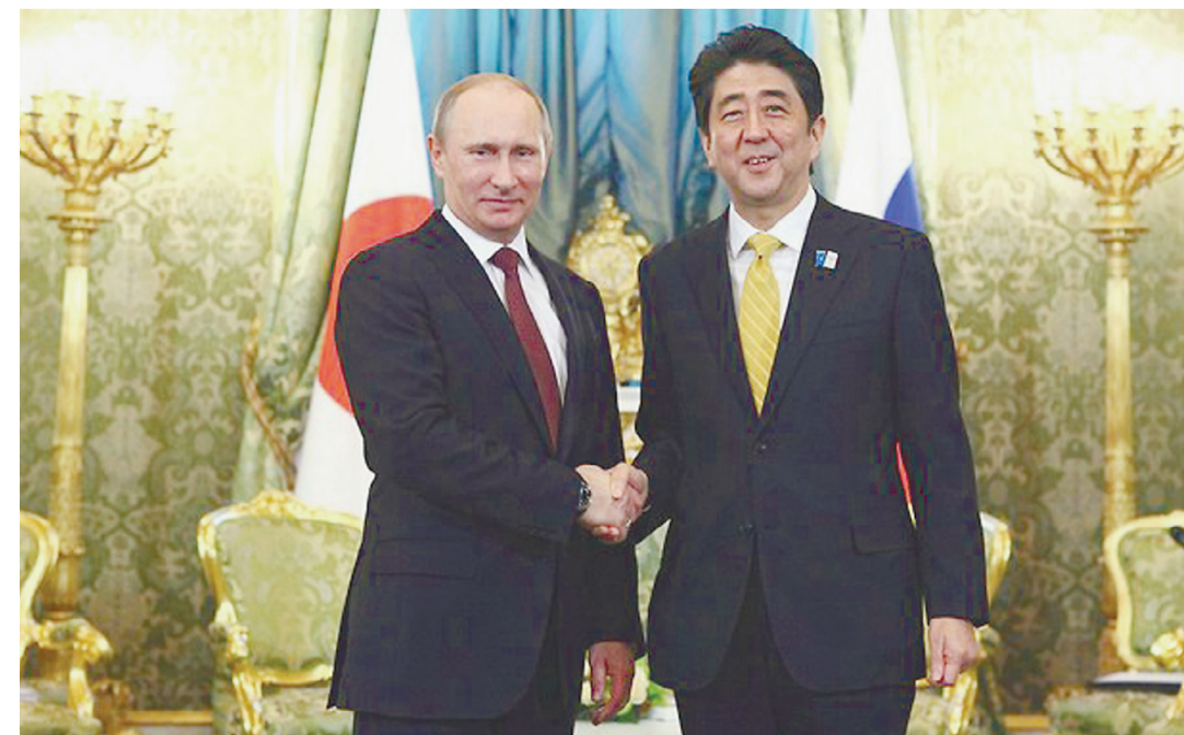
Summit meeting: President of the Russian Federation Vladimir Putin meets with Prime Minister Shinzo Abe on April 29 in Moscow.

During the Russian-Japanese summit, projects for the joint establishment of facilities for the extraction of hydrocarbons