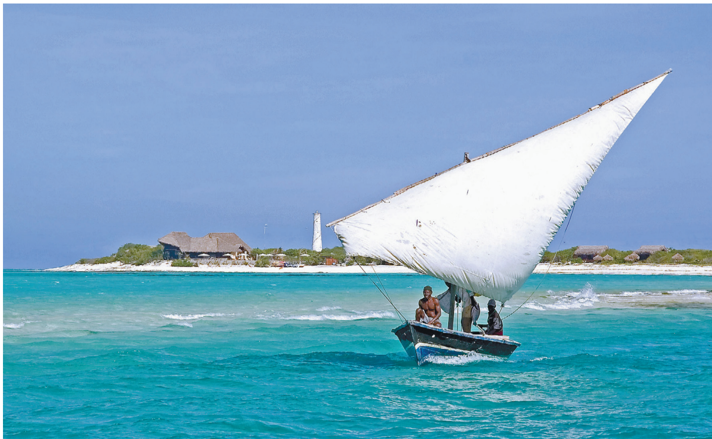
Resort: A dhow vessel sails by the Medjumbe private island in the Quirimbas Archipelago in the Indian Ocean off Mozambique.

The redistribution of the wealth is another challenge that the recently discovered natural resources imposes upon us. The vision of the government sees these could be achieved in three ways. The first is that the many projects that are being implemented to develop natural resources generate employment. The second is through the collection of taxes and in this regard it is also important that the country eliminates the dependence from foreign resources. In 2004 the level of dependence was 48 percent. It is hoped that