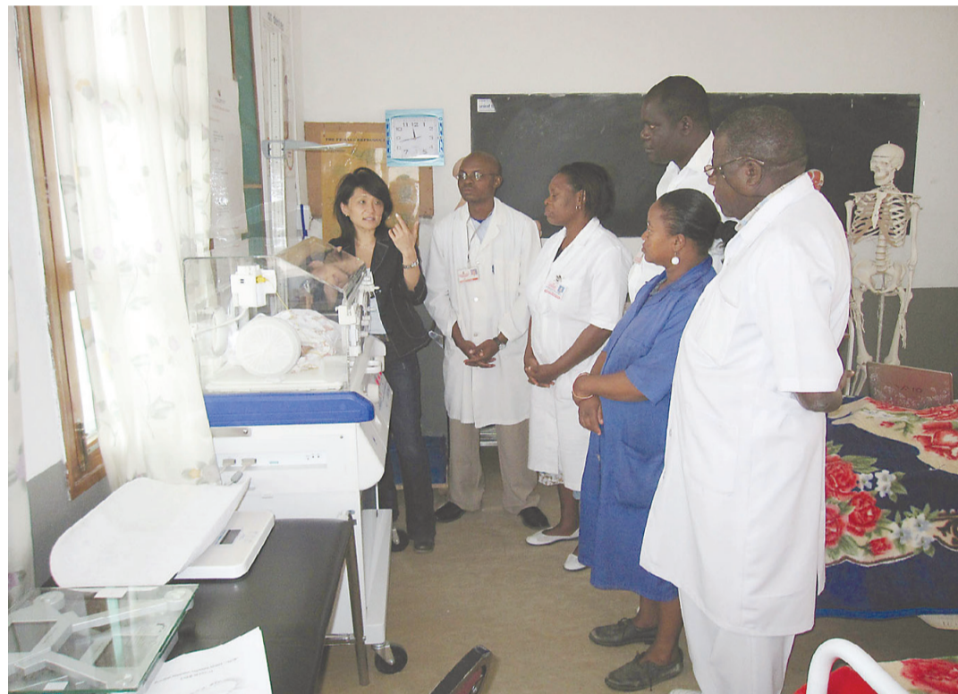
People-to-people: An expert from the Japan International Cooperation Agency (JICA) teaches at a health training institute in Mozambique.

The country continues to experience positive growth rates at an average of more than 7 percent, a trend that the country has maintained since 1996. This developments posts Mozambique among the 10 fastest growing countries in the world; an important achievement if we also consider that the country is cited as the successful example of a nation that achieved peace and reconciliation that produced stability, that in turn is being translated into social and economic development. The macroeconomic reforms that the government is implementing and the positive environment for conducting business in the country have continuously attracted investment. This contributes to making resources available for the development of natural resources and the creation of employment for the young generation. The discovery of enormous reserves of coal in the Tete Province, central part of Mozambique, and of natural gas in the Rovuma basin, located in the northern Mozambique, have generated an additional interest from investors who operate in these areas. Japanese companies have been very active in seizing opportunities to invest in Mozambique. In fact, corporations like Mitsubishi, Mitsui, Nippon Steel