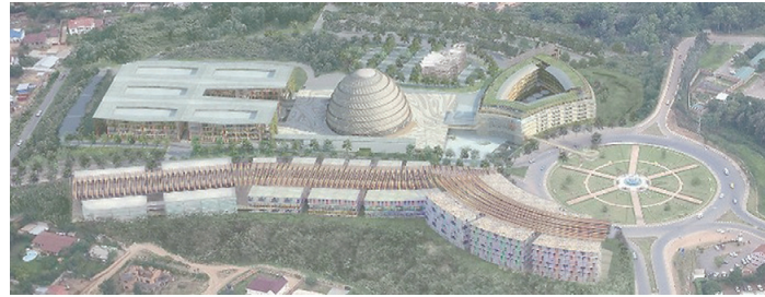
Building for the future: Kigali Convention Center is under construction. EMBASSY OF RWANDA

Vision 2020 sets out to build a private sector-led and knowl-