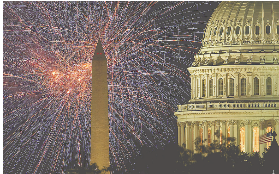
Celebration: Every Fourth of July, fireworks light up the sky in Washington, D.C., over the Washington Monument and U.S. Capitol building. The United States has been a nation of strong leaders, such as the four outstanding presidents — George Washington, Thomas Jefferson, Theodore Roosevelt and Abraham Lincoln — memorialized at Mount Rushmore.

One of the best ways to ensure that our vital partnership continues into the future is to motivate the younger generations in Japan and the United States to get to know each other better. There is no substitute for the hands-on, face-to-face connections that are built when young people study, live, and work in a different culture and society. That is why we are so excited about the success of the Tomodachi Initiative, a public-