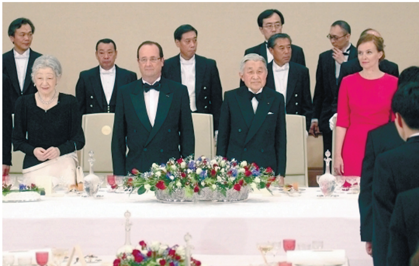
Honored guests: French President François Hollande and his partner, Valérie Trierweiler, attend a banquet at the Imperial Palace hosted by Emperor Akihito and Empress Michiko on June 7 during Hollande's State Visit to Japan.

Our new partnership is targeted to the youth.