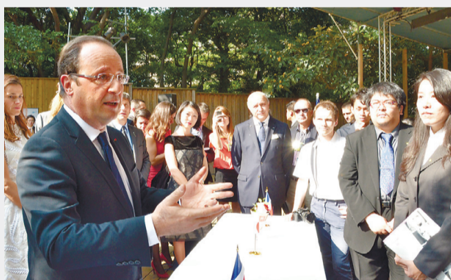
Cultural exchanges: French President François Hollande speaks with students at the French Institute Tokyo on June 8 during his State Visit to Japan.