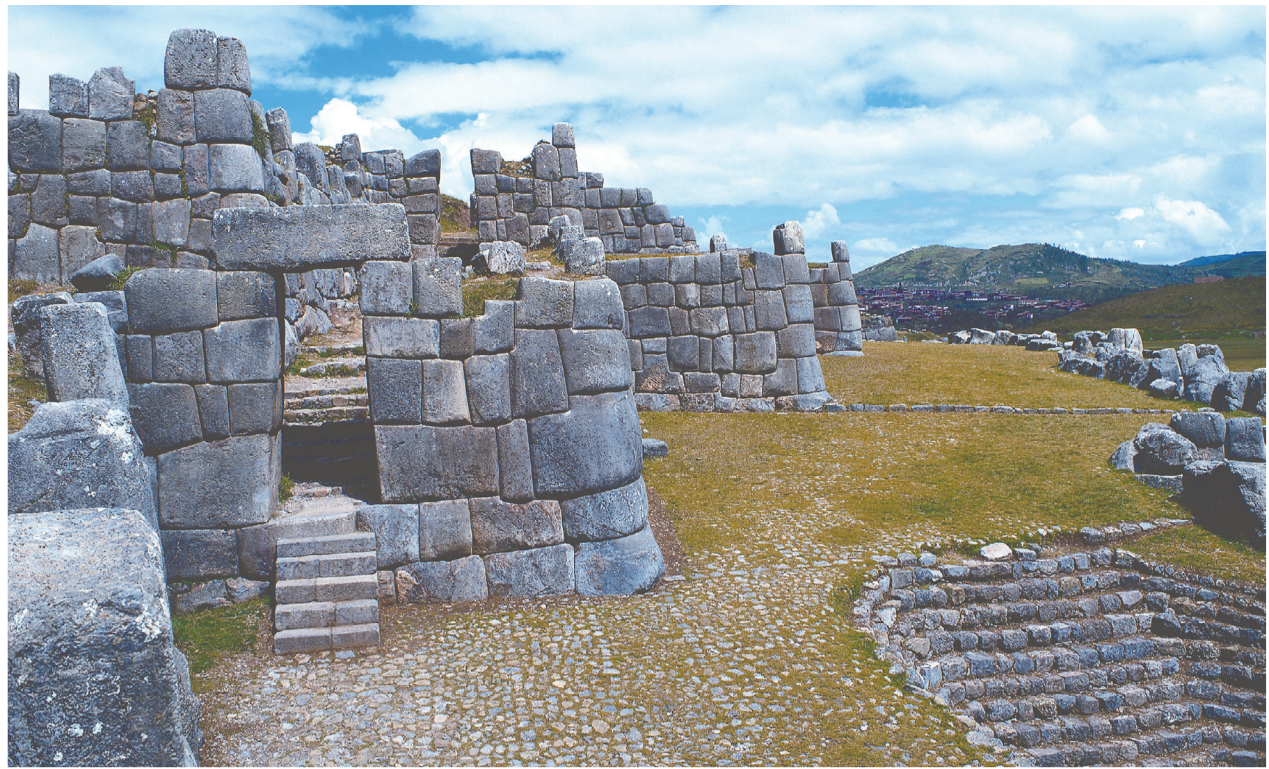
Ancient history: Sacsayhuaman Cusco is a walled complex on the northern outskirts of the city of Cusco, the former capital of the Inca Empire. Right, Sillustani Puno is a pre-Incan burial ground on the shores of Lake Umayo near Puno.