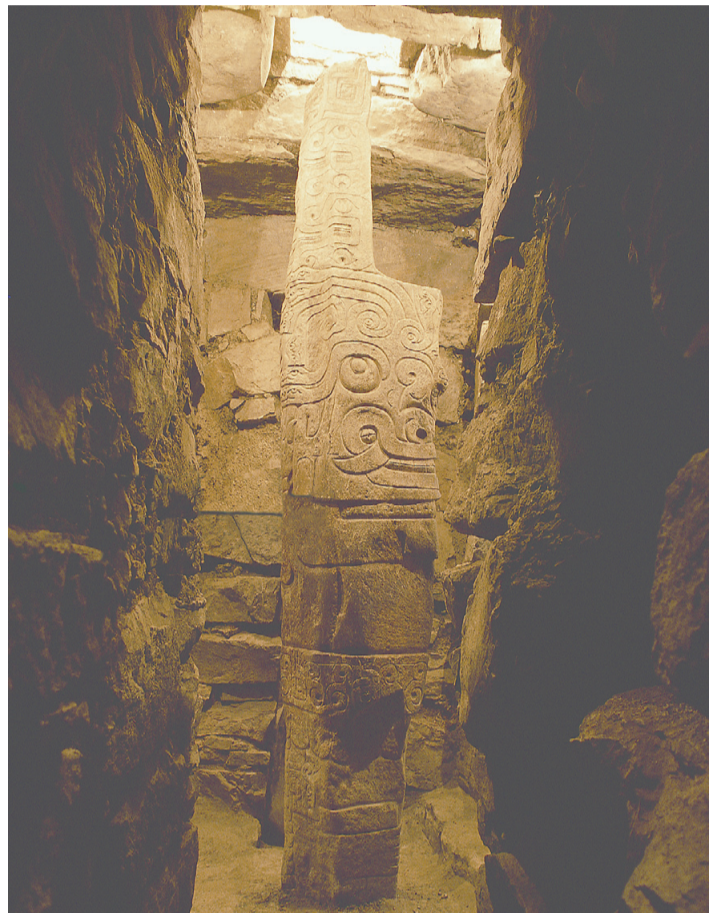
Holy spirit: Lanzon de Chavin is a statue symbolizing the deity of the ancient Chavin culture in the Andes Mountains.