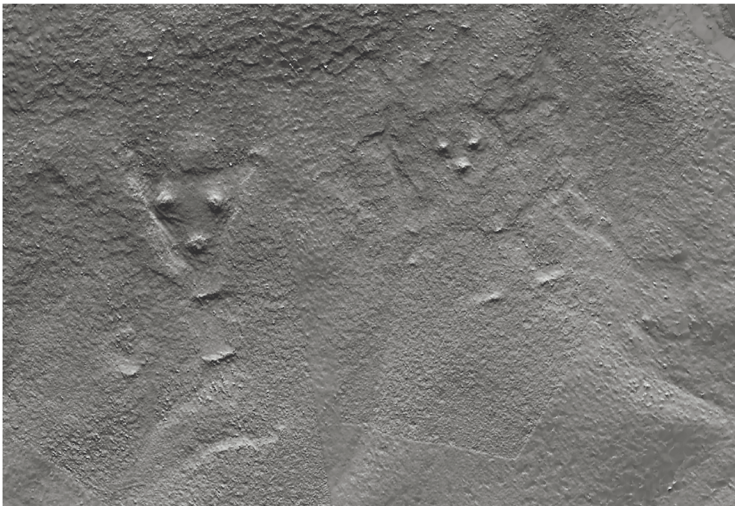
Discovery: A new geoglyph in Peru is officially announced by a Yamagata University research team April 12.

In closing, please allow us to extend our warmest congratulations and best wishes to the government and people of the Republic of Peru on this important day.