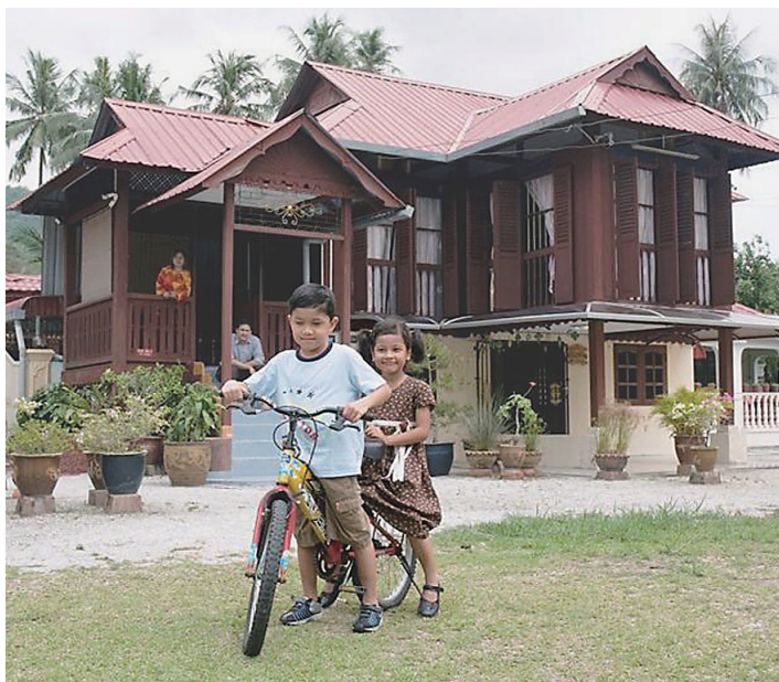
Tourism: Sri Pinang Kampung Stay offers a traditional home-stay experience in Malacca. TOURISM MALAYSIA