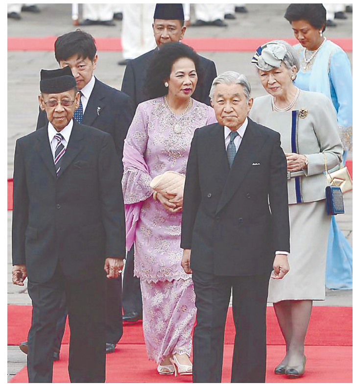
Continued closeness: The King and Queen of Malaysia the Yang di-Pertuan Agong XIV (left) and the Raja Permaisuri Agong XIV (center) are welcomed by Emperor Akihito and Empress Michiko at the Imperial Palace on Oct. 3 during the state visit of Their Majesties to Japan.

Following its 13 successive returns to lead Malaysia, the ruling Barisan Nasional under the leadership of Prime Minister Najib reaffirmed the commitment of the ruling coalition to ensure the nation's economic growth continues to flourish in the years to come. Prime Minister Najib also reiterated the importance for the government to maintain continued stability, peace and harmony and in this regard stated that his administration would next undertake the process of national reconciliation that would in specific reject extremism in favor of moderate and accommodative politics, so as to