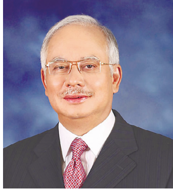
Prime Minister Dato' Seri Mohd Najib Tun Abdul Razak of Malaysia

Aug. 31 marks the 56th anniversary of the independence of Malaysia. On this auspicious occasion, I have the great honor to convey my heartfelt greetings to Their Imperial Majesties Emperor Akihito and Empress Michiko, the Imperial family, the government and the friendly people of Japan. I would also like to extend my warm greetings to all Malaysians, friends of Malaysia and readers of The Japan Times.