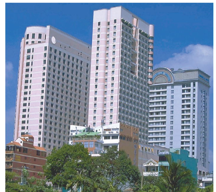
Commercial center: Ho Chi Minh City is the largest city in Vietnam. ASEAN-JAPAN CENTRE

Japan and Vietnam are building together the strategic partnership for peace and prosperity in Asia, thus opening up an era of most far-reaching bilateral cooperation. However, new issues may arise as bilateral relations deepen. We believe that on the basis of long-standing traditional friendship between the two nations, bilateral relations will see a new era of peace, lasting development and humanity.