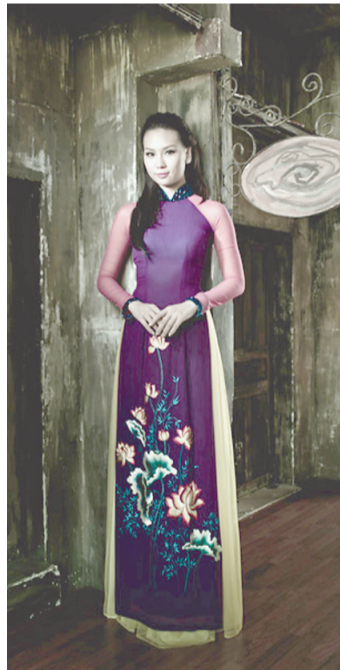
Cultural exchanges: Vietnamese traditional music and performing arts, as well as a fashion show of traditional long dresses called "ao dai," will be introduced during the Vietnamese Days in Japan from Sept. 12 to 22.

This year, the festival is being co-organized by the Embassy of Vietnam and the Japanese committee. Around 90 booths, which are the largest-ever number for the festival, will display and sell various Vietnamese foods, products and organize exhibitions on culture, business and tourism. With the cooperation of the embassy, the Vietnam House will introduce various attractions of