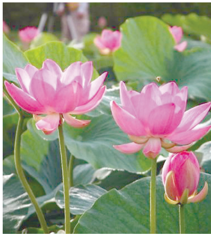
National flower: To the Vietnamese, the lotus, which is found throughout the country, is the symbol of purity, commitment and optimism for the future.

Japan and Vietnam have similar traditional culture in common since ancient times. Today, both countries take the same stance on strategic interests and