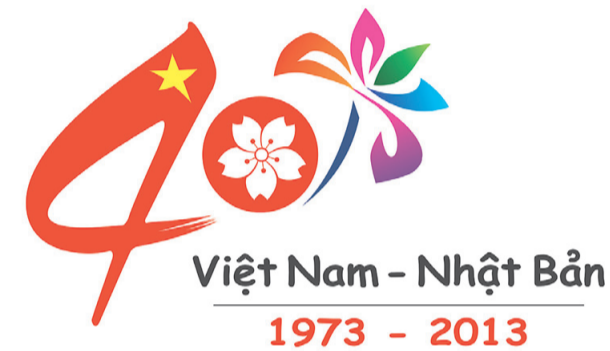
Commemoration: The official logo of the Japan-Vietnam Friendship Year. EMBASSY OF VIETNAM