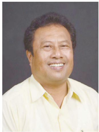
Tommy E. Remengesau Jr. PRESIDENT, REPUBLIC OF PALAU

On behalf of the government and the people of Palau, let me extend my heartfelt greetings today to Their Imperial Majesties Emperor Akihito and Empress Michiko and our hopes for their continued good health and happiness.