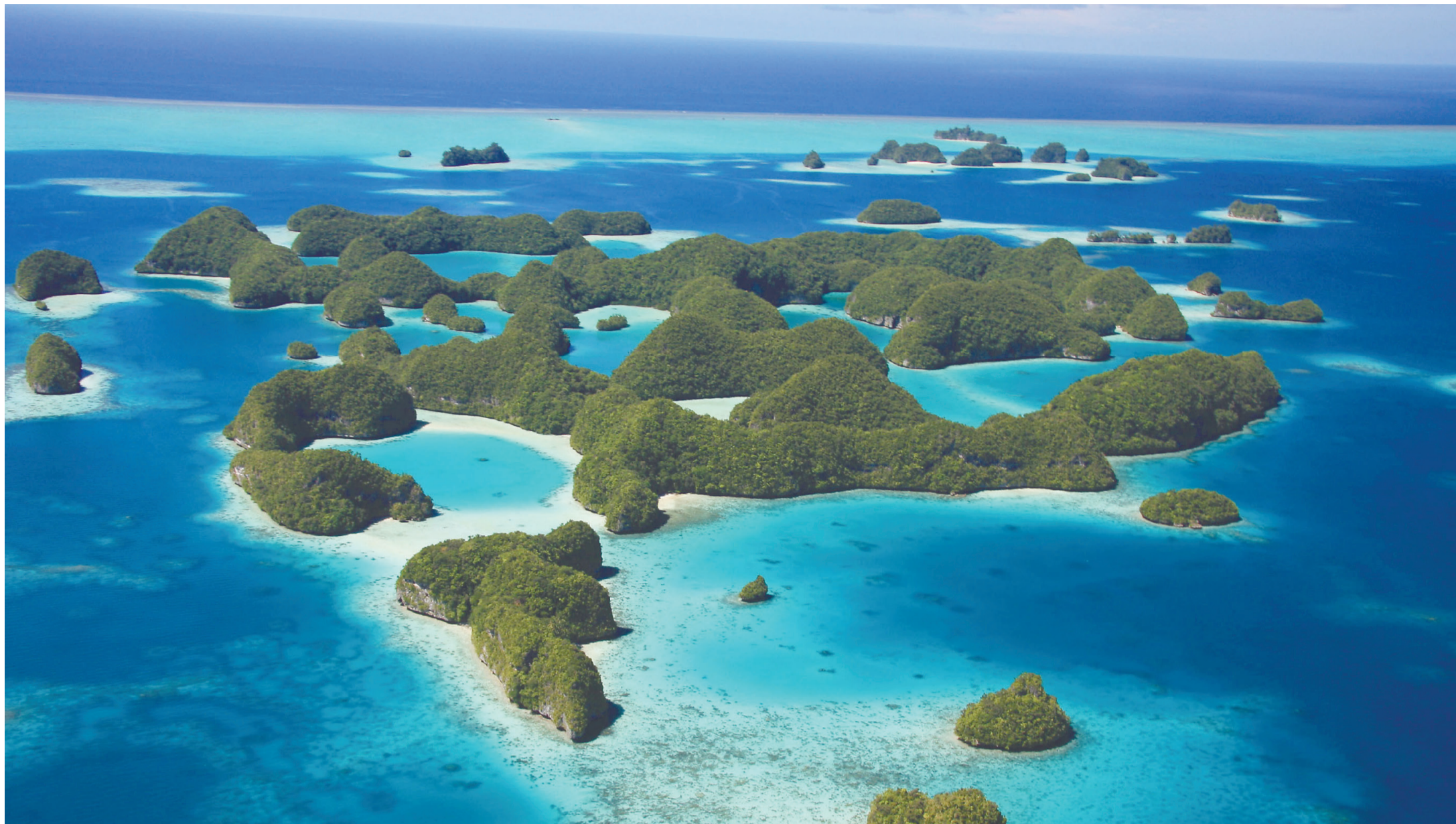
Natural wonder: Palau's UNESCO World Heritage site Rock Islands Southern Lagoon encompasses 100,200 hectares, including 445 islands of volcanic origin. EMBASSY OF PALAU

Palau is also working with Japanese officials to organize