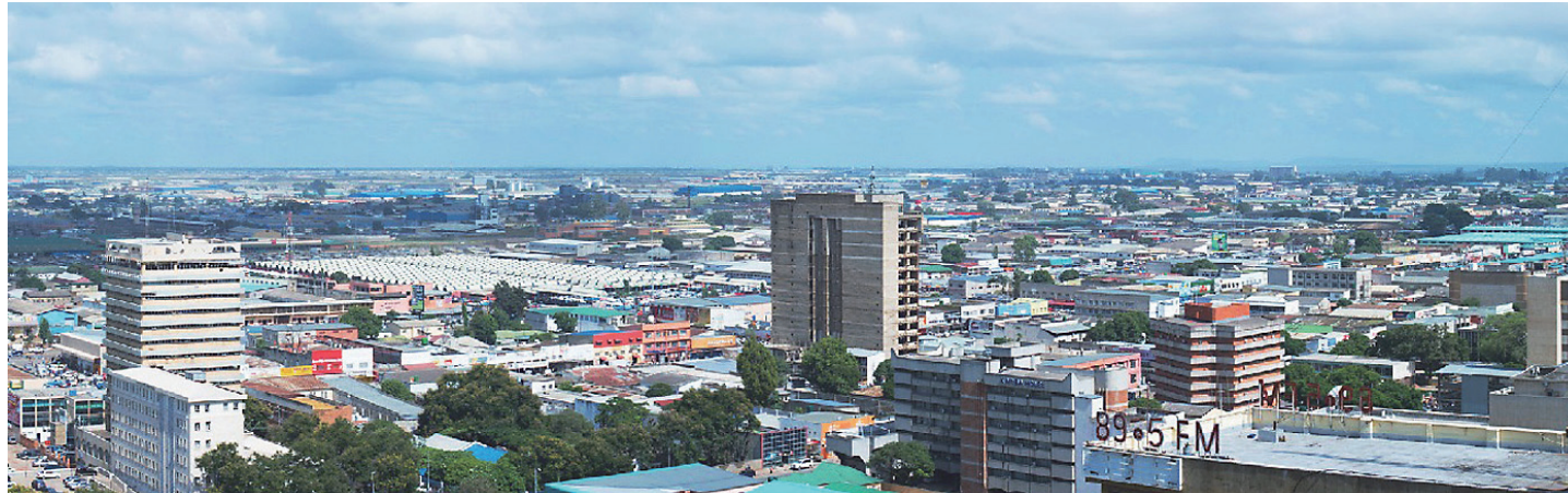
Nation's heart: The largest city and the center of commerce and government in Zambia, Lusaka is one of the fastest-developing cities in Southern Africa. ZAMBIATOURISM BOARD

Zambia and Zimbabwe successfully co-hosted the 20th Session of the United Nations World Tourism Organization General Assembly (UNWTO) in August. The event attracted over 4,000