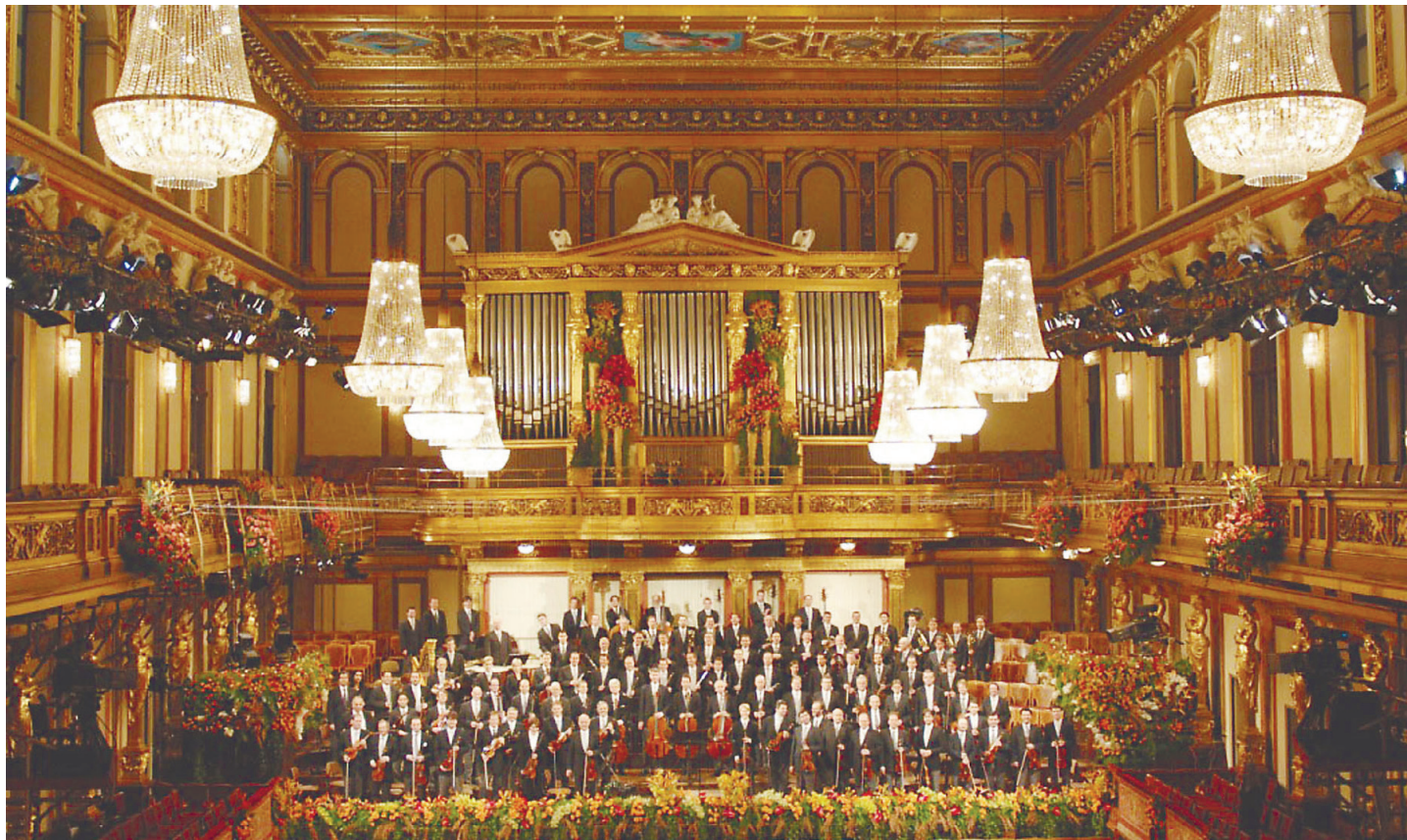
City of music: The prestigious Vienna Philharmonic Orchestra is based at the Musikverein in Vienna.

For Austria, Japan is one of its most important trading partners and the second most important market for Austrian companies in Asia. In 2012, Austrian exports to Japan have further increased, reaching a level beyond 1.3 billion euros. Austrian enterprises have extended their presence in Japan over the past few years. Some 900 Austrian companies