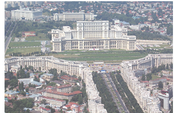
Landmarks: (Top) Bran Castle is known as "Dracula's Castle." (Above) An aerial shot of Bucharest shows the Palace of the Parliament, the world's second-largest building after the Pentagon in Washington, D.C.

A good example of fruitful cooperation in the cultural field is, since 2005, the annual Romanian International Classic Music Contest, organized in Tokyo by the Japan-Romania Music Association. Young musicians from Japan have the opportunity to discover the jewels of the Romanian school of music and to be promoted to the world stage. Also, this year was marked by the visit to Japan of the delegation of the National Oina Federation.