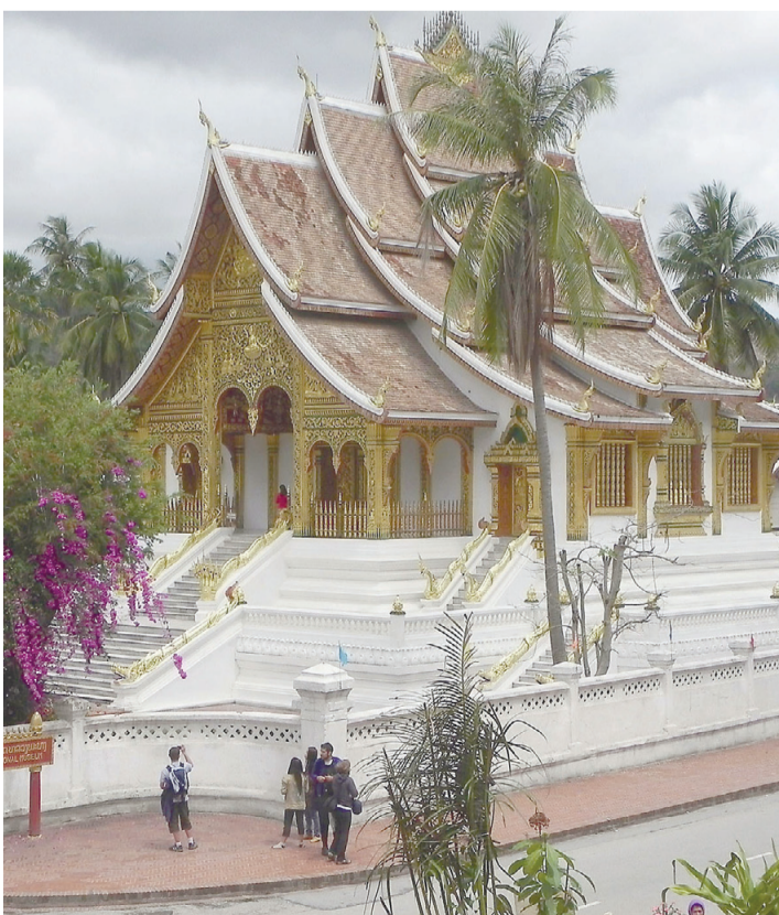
Top attraction: Located in north-central Laos on the Mekong River, Luang Prabang, once the capital of the Lan Xang Kingdom from the 14th to 16th centuries, has been a UNESCO World Heritage site since 1995. EMBASSY OF LAOS

Congratulations to the Lao People's Democratic Republic on the 38th Anniversary of Their National Day