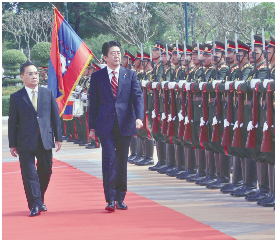
Stronger ties: (Right) H.E. Shinzo Abe, prime minister of Japan, pays a courtesy call on H.E. Choummaly Sayasone (seated right), president of Laos, on Nov. 17 in Vientiane. (Above) Laos Prime Minister Thongsing Thammavong (left) welcomes Prime Minister Abe at an official ceremony the same day.

Laos and Japan have enjoyed good relations and cooperation on bilateral, regional as well as international issues. Japan has remained Laos' No. 1 ODA donor for many years. The Japanese assistance mainly focuses on infrastructure, education, human resource development, improving health and sanitation, and building schools. The Japanese assistance is in response to