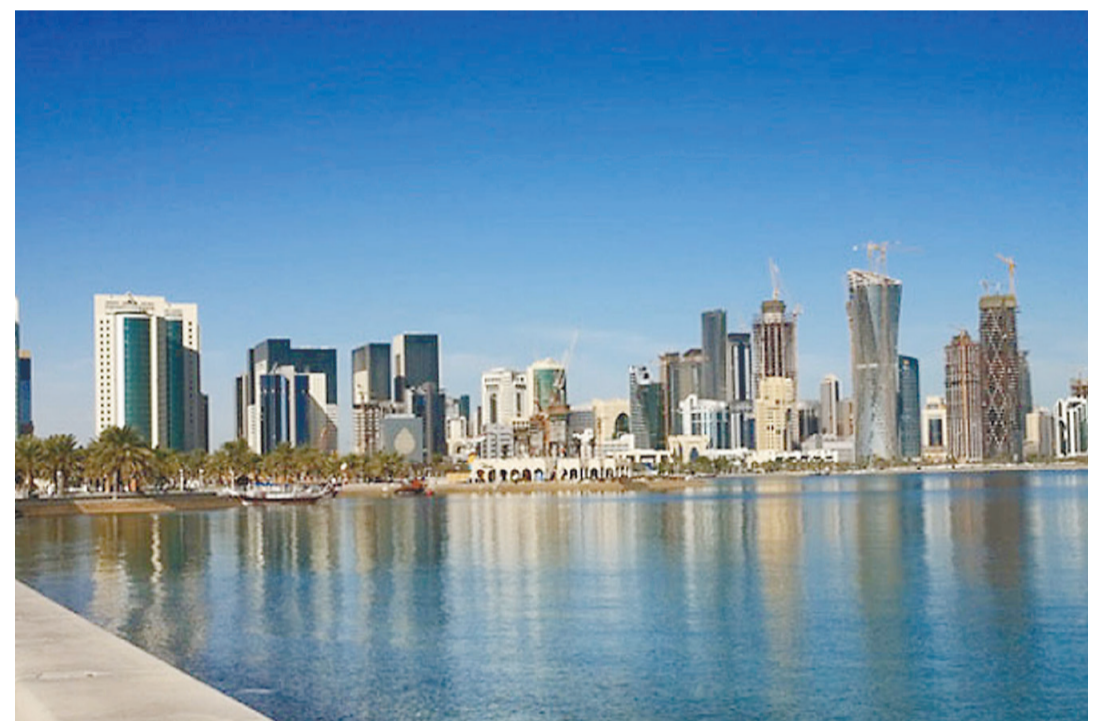
On the waterfront: A view of the Doha Corniche EMBASSY OF QATAR

The current account surplus rose sharply (32.0 percent of