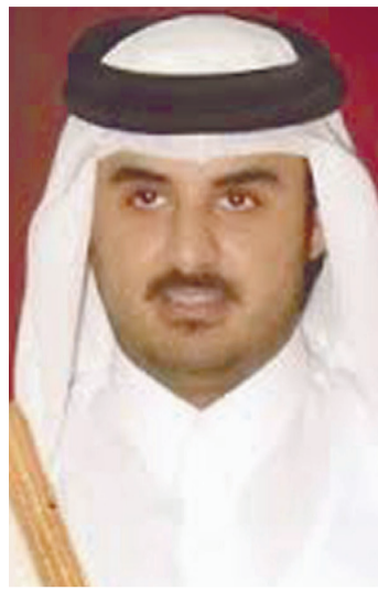
H.H. Emir Sheikh Tamim Bin Hamad Al-Thani of the State of Qatar

Qatar has proved its strong presence at regional and international arenas by pursuing a balanced foreign policy and insightful visions that enabled it to play