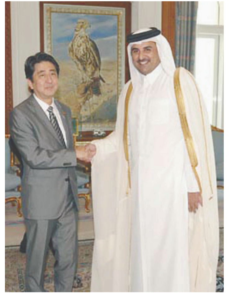
Welcome: H.H. Emir Sheikh Tamim Bin Hamad Al-Thani shakes hands with Prime Minister Shinzo Abe in Doha in August.

In closing I wish to express my deepest appreciation to The Japan Times for giving me this opportunity to address its distinguished readers on this glorious occasion, and I would like to express my best wishes to all for a happy, peaceful and prosperous new year.