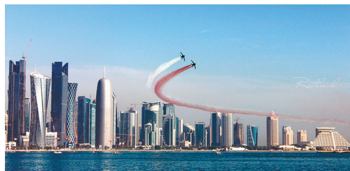
Fly past: Aircraft perform during a National Day celebration Dec. 18, 2012.