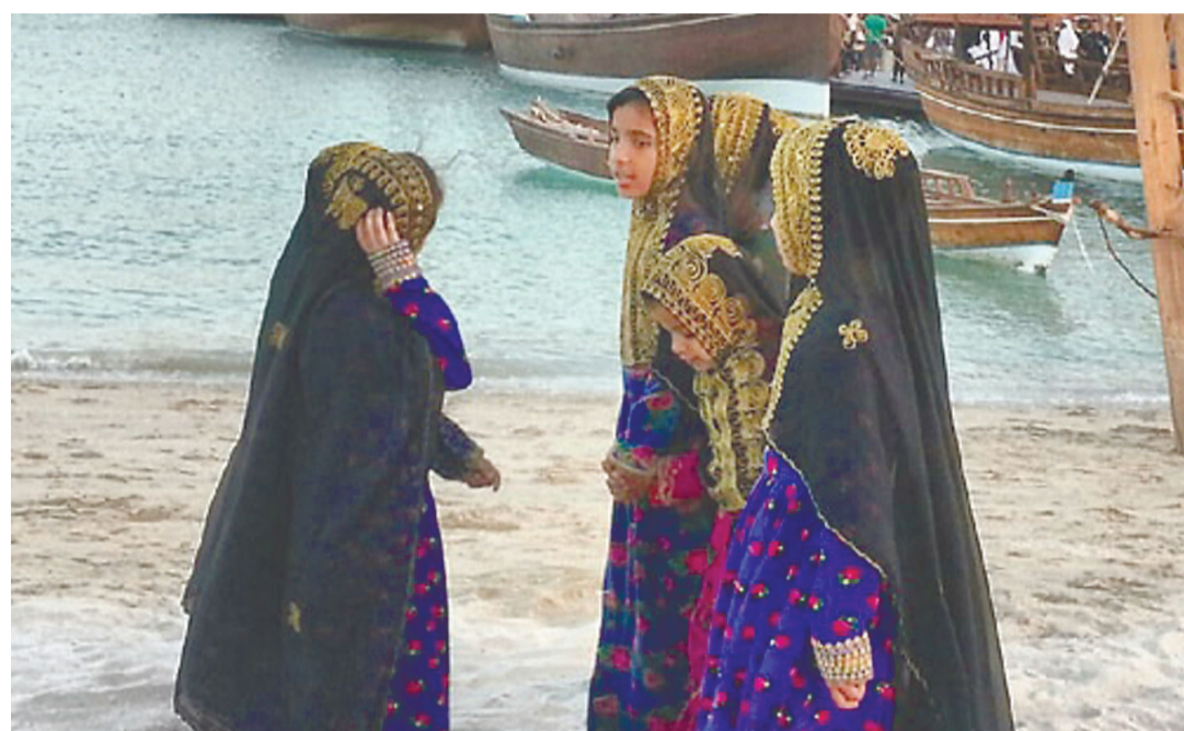
Heritage: Girls wear traditional dresses on Qatar's National Day.

The two countries agreed to build a "partnership for stabil-