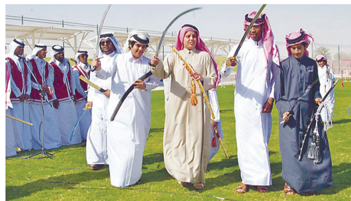
Celebrations: People march to mark Qatar's National Day on Dec. 18 last year.

The QFF supports projects that address urgent, crucial and sustainable needs for the greatest number of beneficiaries. It is working on a total of nine projects in the fisheries, education and health care sectors in the three affected prefectures, Fukushima, Miyagi and Iwate. Several large-scale projects have been completed and are contributing to improving the lives of people in these areas. All projects are expected to be completed by the end of next year.