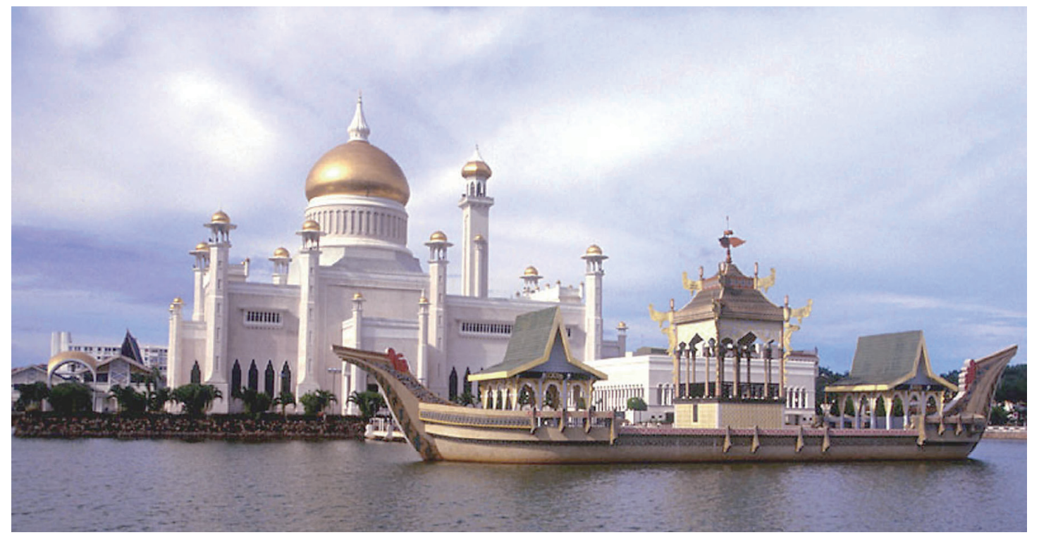
The Sultan Omar Ali Saifuddin Mosque is the landmark of Brunei's capital Bandar Seri Begawan.

Lastly, I would like to extend my sincere best wishes to H.M. Sultan Haji Hassanal Bolkiah, the royal family and the people of Brunei Darussalam for their continued health and further prosperity.