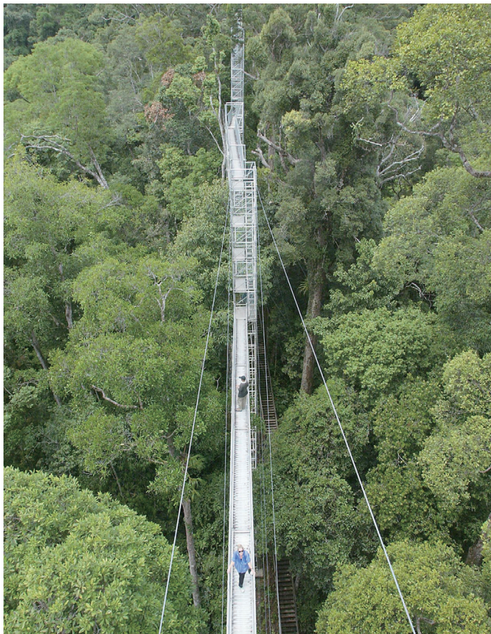
Tourists can enjoy the canopy walkway and experience the unspoiled rain forest in Ulu Temburong National Park in eastern Brunei.

Congratulations on the 30th National Day of Negara Brunei Darussalam