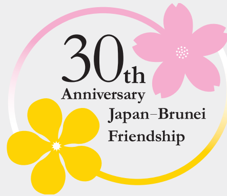
Official logo celebrating 30 years of friendship between Japan and Brunei.

On this auspicious occasion of the 30th National Day of Brunei Darussalam, Japan and Brunei also mark the 30th year of diplomatic relations. Based on trade in the natural resources sector, Japan and Brunei Darussalam have cemented a good relationship in all areas. I understand many events celebrating the 30th year are scheduled throughout this year. I sincerely hope that mutual understanding will