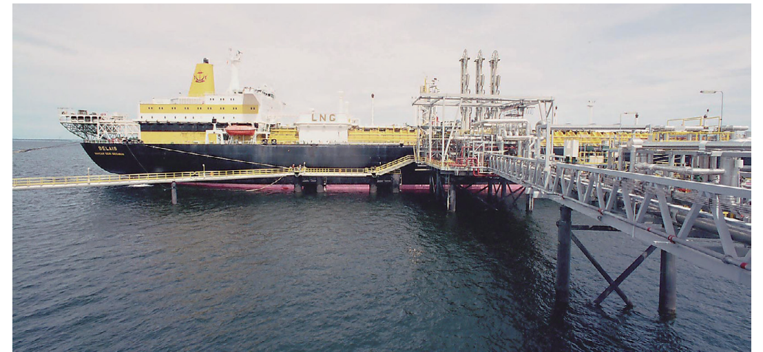
An LNG tanker is loaded with one of Brunei's main exports.

In addition to that, the government of Brunei Darussalam has also been investing in non-energy related projects aimed to add value to Brunei Darussalam's existing resources. Coop-