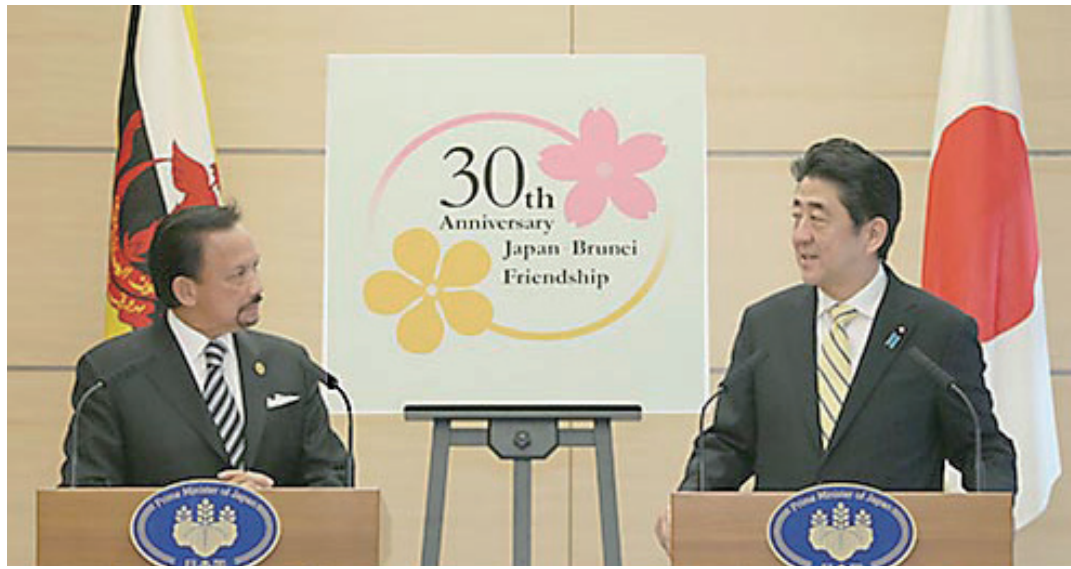
H.M. Sultan Haji Hassanal Bolkiah and Prime Minister Shinzo Abe unveil the 30th Anniversary logo on Dec. 13 on the sidelines of the ASEAN-Japan Commemorative Summit.

It is also a pleasure to note that we are also celebrating 30 years since the establishment of diplomatic relations with Japan this year. The relationship between our two countries, which has spanned over four decades