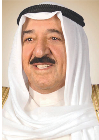
Amir of the State of Kuwait Sheikh Sabah Al-Ahmad Al-Jaber Al-Sabah

The State of Kuwait has been carrying out a massive national development plan that includes several mega-projects such in infrastructure, the medical field and other sectors. Accordingly, we welcome the participation