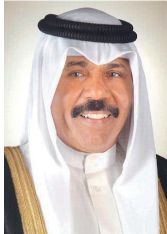
Crown Prince of the State of Kuwait Sheikh Nawaf Al-Ahmad Al-Jaber Al-Sabah

The State of Kuwait has always considered Japan a distinguished economic partner, and as such, it has been seeking closer ties, increasing trade exchanges and joint investment opportunities, especially after Kuwait adopted a new law to promote foreign investment. In this regard, and to emphasize the importance of collaboration on the private sector level, the Kuwaiti-Japanese Businessmen's Committee was established in 1995 and has since held regular annual meetings. The main goal of this committee is to enhance the exchange of opinions and mutual sharing of expertise on the best ways for both sides to benefit from the know-how of Japanese compa-