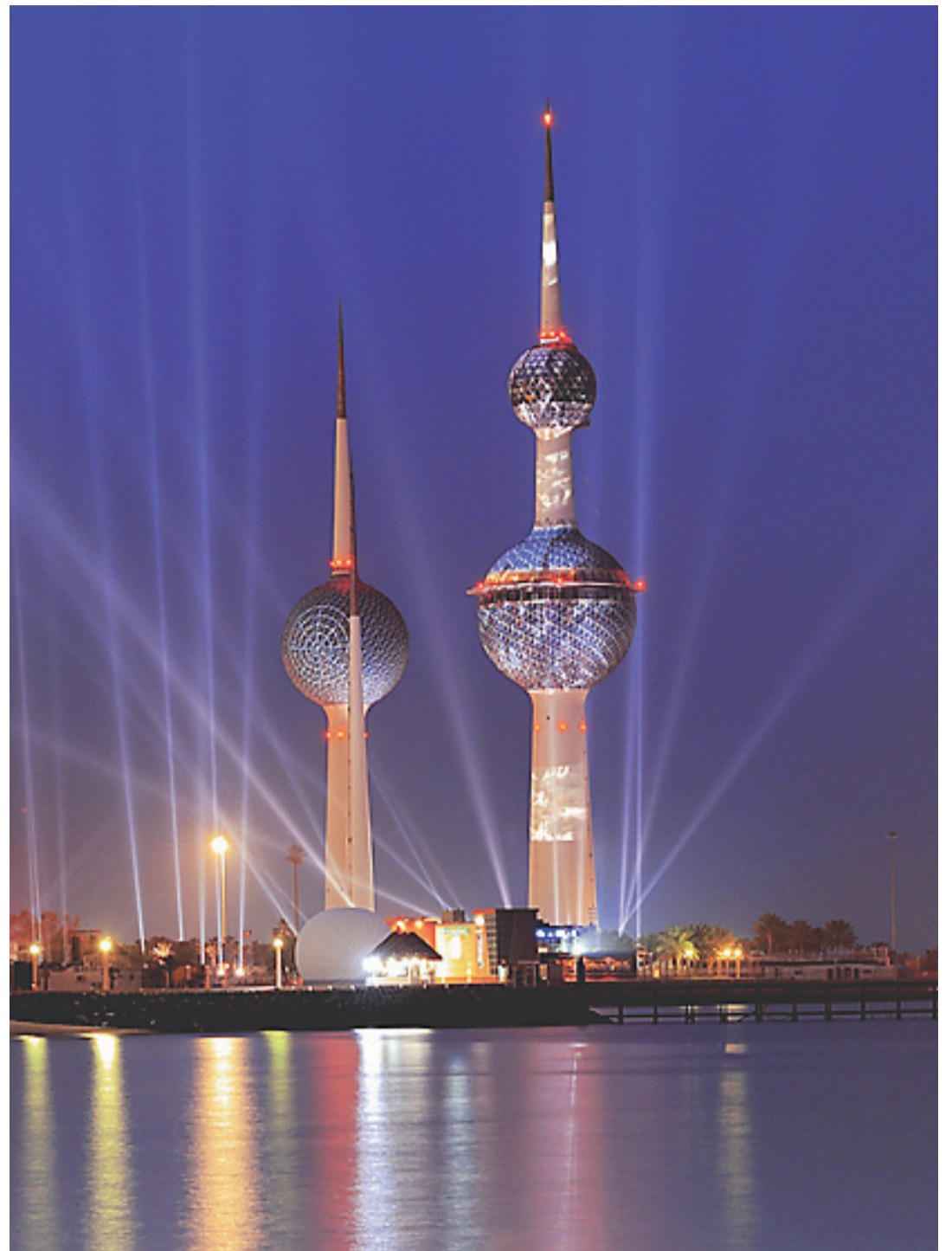
Night view of Kuwait City's Kuwait Towers, which are a favorite attraction for visitors to the Gulf state.

The State of Kuwait, though itself an emerging country, has since its independence in 1961 paid great attention to the needs of other emerging nations, providing them with assistance and support through the Kuwaiti Fund for Economic Development and through other mechanisms and initiatives. The Fund is one of the principal