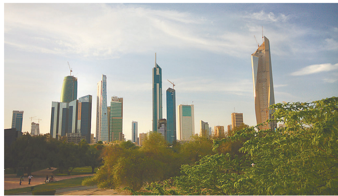
(Above) Kuwait City, which houses many skyscrapers, is the capital and largest city of Kuwait.

On one side, our country bears the responsibility of paving the way to achieving full integration between the countries of the GCC in response to the aspirations of the people and countries of the council. This transition from the stage of cooperation to a phase of union requires many accomplishments that pave a more confident way to full integration. On the other, there are challenges experienced by our region and the world in general. However, by virtue of its good relations with all nations around the world based on the principles of the U.N. and provisions of the international law; such as building trust between nations, good-neighborliness and mu-