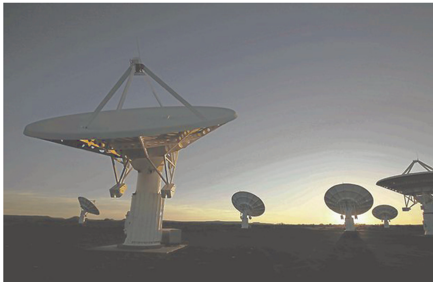
(Above) Located near the town of Carnarvon in South Africa's Northern Cape Province, the seven-dish KAT-7 telescope is the precursor engineering test bed for the MeerKAT telescope and the first radio telescope array consisting of composite antenna structures. (Right) Toyota South Africa assembly plant in Durban, which has continued to contribute to the local economy since it was built in 1997.

South Africa joined the ranks of Brazil, Russia, India