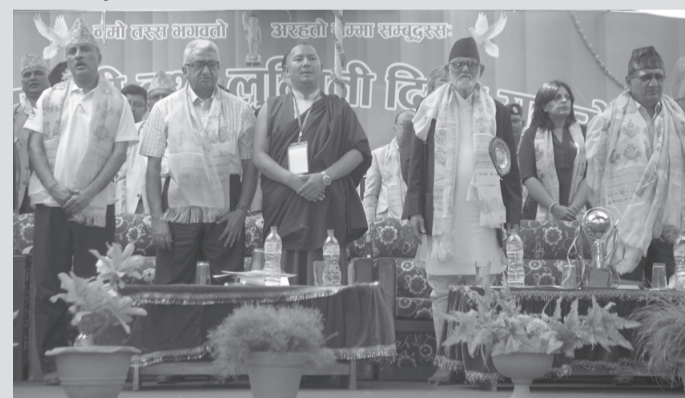
The Right Honorable Prime Minister Sushil Koirala (third from right) was welcomed to Buddha Jayanti in Lumbini, where Buddha was born, on May 14.

2558th Buddha Jayanti and Lumbini festival on 14 May 2014.