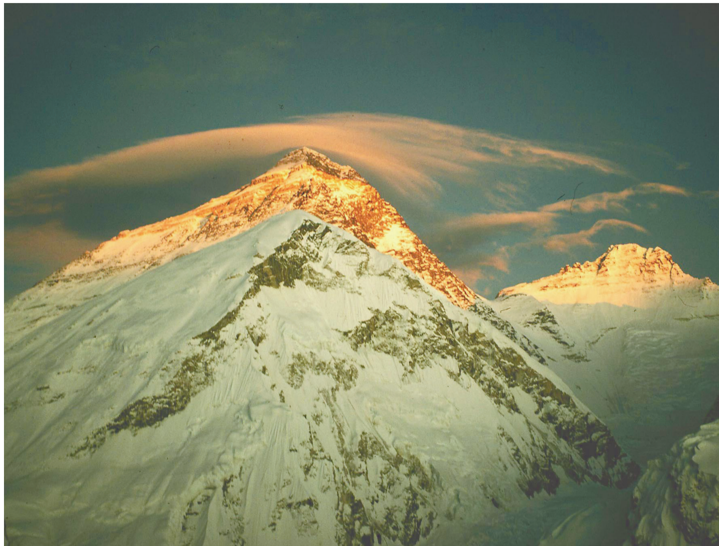
Mount Sagarmatha (Everest) is the world's tallest mountain.