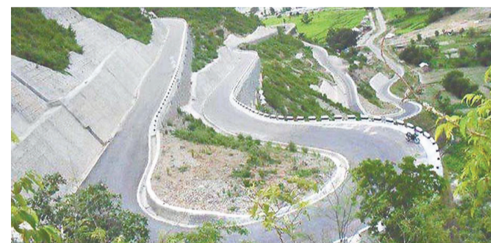
Also known as the BP Highway, after Nepal's first elected prime minister, work on the Banepa-Sindhuli road began in 1996 with Japanese grant assistance. The government of Nepal has set a target to complete it by March 2015. EMBASSY OF NEPAL

With these words, may I once again greet all the readers of The Japan Times, which has rendered a great service to the cause of bilateral relations by publishing this special supplement to mark our Republic Day celebrations.