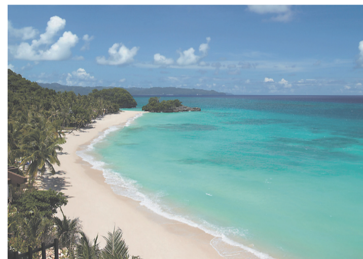
The Philippines is home to beautiful white sand beaches. EMBASSY OF THE PHILIPPINES

not only our respective peoples, but will be a key to the future stability and prosperity of our Asia-Pacific neighborhood as well. Mabuhay!