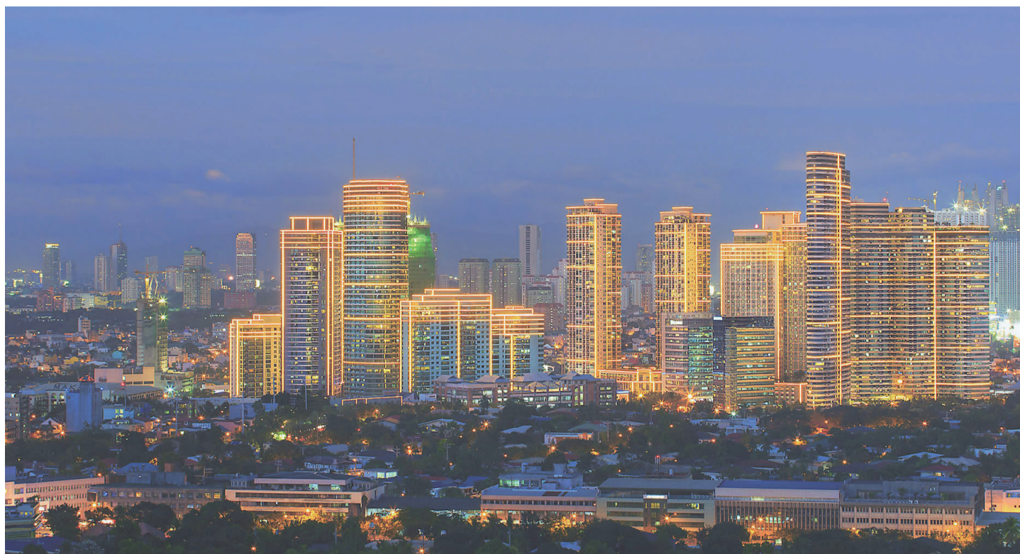
(Above) A night view of bustling and upscale Makati City, Metro Manila. (Right) Located on the west coast of the large island of Luzon, the city of Vigan is one of the countries' few remaining Hispanic towns. It is known for its cobblestone streets and unique architecture, earning it designation as a UNESCO World Heritage site.

International experts are unanimous in their optimism: the Philippines has shifted to a higher growth trajectory and will continue to attain high rates of economic expansion on the back of rising investments and business confidence. The challenge is to sustain and make this growth