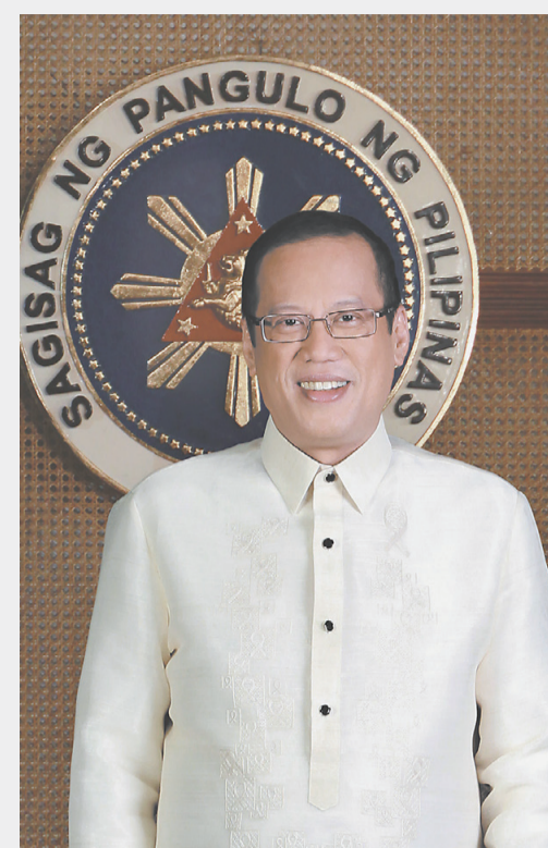
a strategic ally in securing harmony, stability and rule of law in our region and its waters. We look forward to working with you in further enhancing close cooperation between our two countries.

We foster with Japan one of our most enduring and important bilateral relationships. Japan is our largest trading partner, top provider of official development assistance (ODA) and a major source of investment and tourists. Japan has steadily supported our efforts to realize peace and development in Mindanao and, just as importantly, Japan is