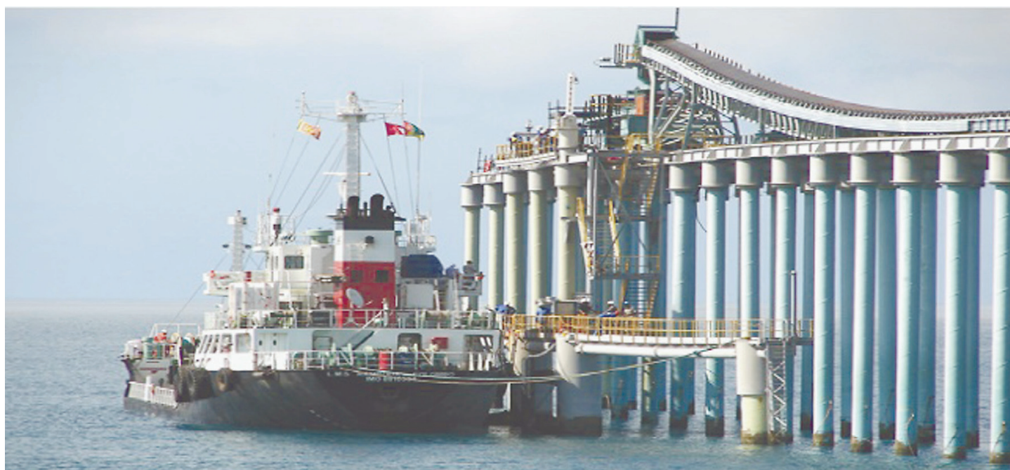
Development of natural resources in Mozambique EMBASSY OF MOZAMBIQUE

Abe was accompanied during his visit to Mozambique by about 30 presidents and CEO's of 29 leading corporations, a