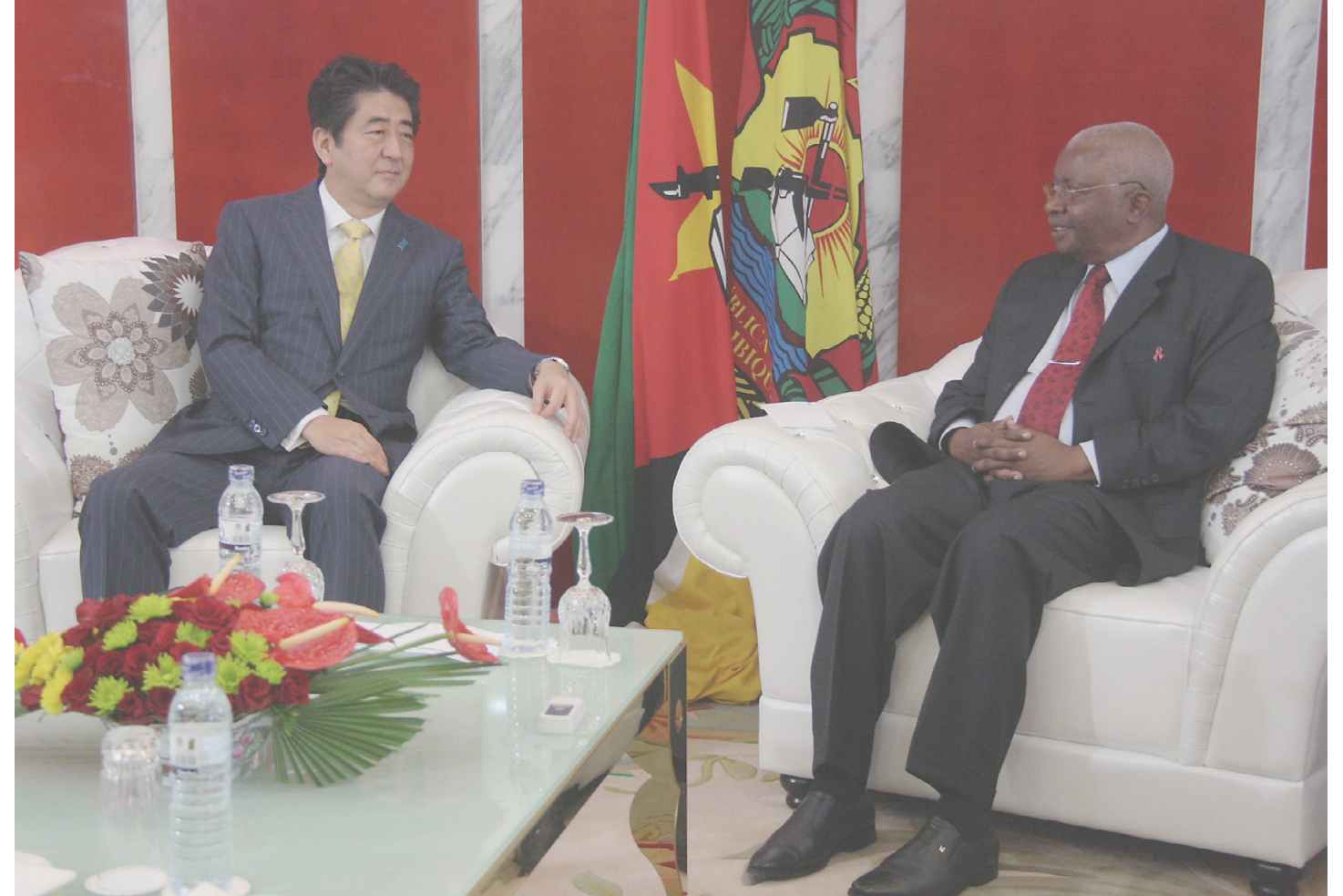
Mozambican President Armando Guebuza meets with Prime Minister Shinzo Abe on Jan. 12 in the capital Maputo during Abe's visit to Mozambique.

Foreign direct investment has also increased significantly. A total of more than $25 billion have been invested in Mozambique over the last decade by countries such as the United Kingdom, Portugal, the United Arab Emirates, Mauritius, China, India, South Africa, Brazil, the U.S. and others, which make up the list of the top 10 investors in Mozambique. From 2009 to 2014, we received investment projects worth about $18.8 billion. Japanese FDI is firmly flowing to Mozambique to take advantage of the positive environment for doing business and the ample business opportunities that the country offers. Corporations like Mitsubishi, Sojitz, Mitsui, Nippon Steel, Sumitomo Mital, Impex, Hitachi, Marubeni, Toyota Tsusho Corporation, Toyo Engineer-