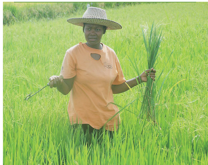
Rice cultivation in Mozambique EMBASSY OF MOZAMBIQUE

ing, JGC Corporation, Matsuda Consultants are very active in many projects ranging from energy and natural resources, to agriculture, construction and services. It is our hope that both Mozambican and Japanese private sectors take full advantage of the entering into force of the Agreement on Reciprocal Liberalization, Promotion and Protection of Investment, signed last year between the two governments.