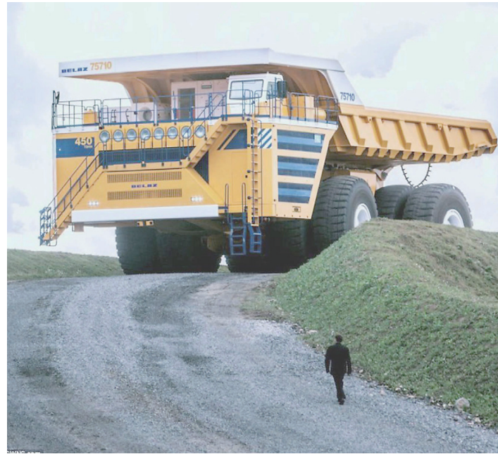
The BelAZ 75710, weighing 360 tons and having a carrying capacity of 450 tons, is a new dump truck from the Belarusian company. EMBASSY OF BELARUS

We continued active cooperation in the sphere of rehabilitation of the areas affected by the nuclear power plant accident. In July, 2013, according to the Belarusian-Japanese in-