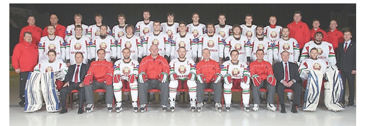
Top, Minsk Arena was among the facilities to host the 2014 Ice Hockey World Championships in May. Above, the Belarusian national hockey team.

Congratulations to the People of the Republic of Belarus on the Occasion of Their Independence Day