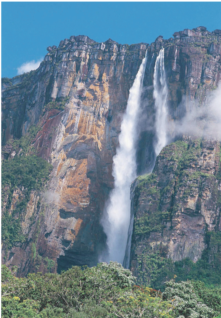
Angel Falls in Canaima National Park, a UNESCO World Heritage site, is the world's tallest waterfall at 979 meters.

President Nicolas Maduro, after his election in April 2013, has vowed not only to continue the Bolivarian Revolution but also to expand its reach and to improve its efficiency. Last December, Maduro passed a law, with majority support from the National Assembly, for the Second Social and Economic Development National Plan, thus cementing the legacy of late