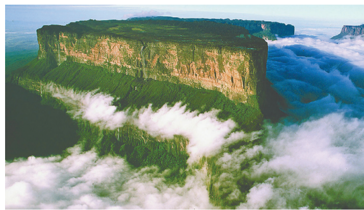
Venezuela is home to many tabletop mountains. EMBASSY OF VENEZUELA