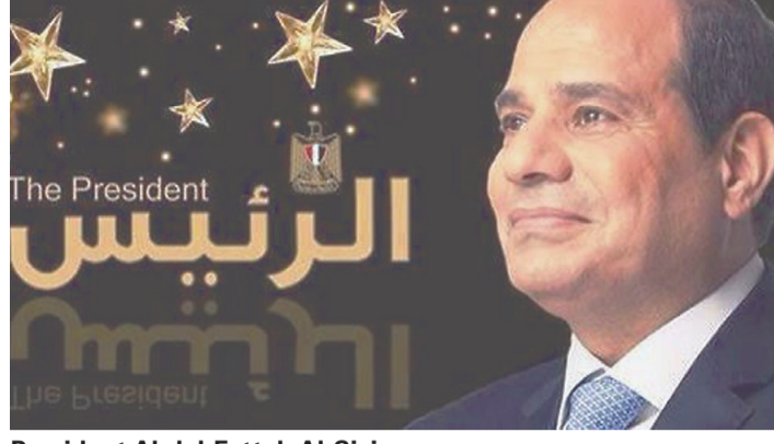
President Abdel-Fattah Al-Sisi