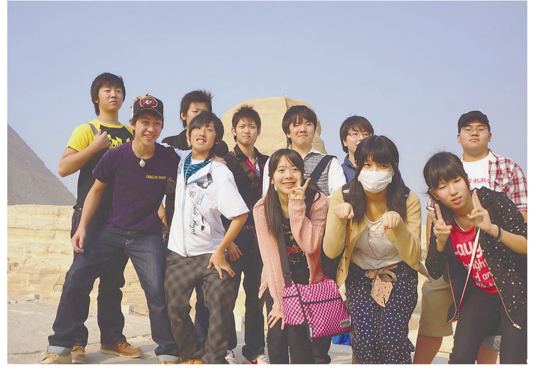
Tohoku teenagers visit Egypt for a New Year's celebration.