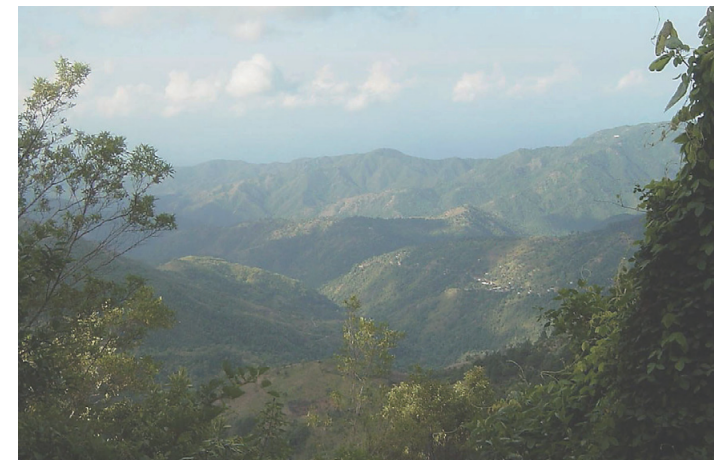
Coffee grown in the Blue Mountains in Jamaica is considered to be one of the finest and most sought-after varieties in the world.

In years past, Bob Marley was the singular Jamaican name which enjoyed univer-