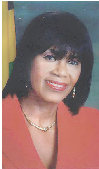
Jamaican Prime Minister the Most Hon. Portia Simpson Miller

While Jamaica moves forward with these plans, it has