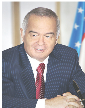
President of the Republic of Uzbekistan H.E. Islam Karimov

Over the 23 years of independent development, the national economy of Uzbekistan grew by 4.1 times and the real income of the population rose 8.2 times. The country also saw the annual GDP growth rate