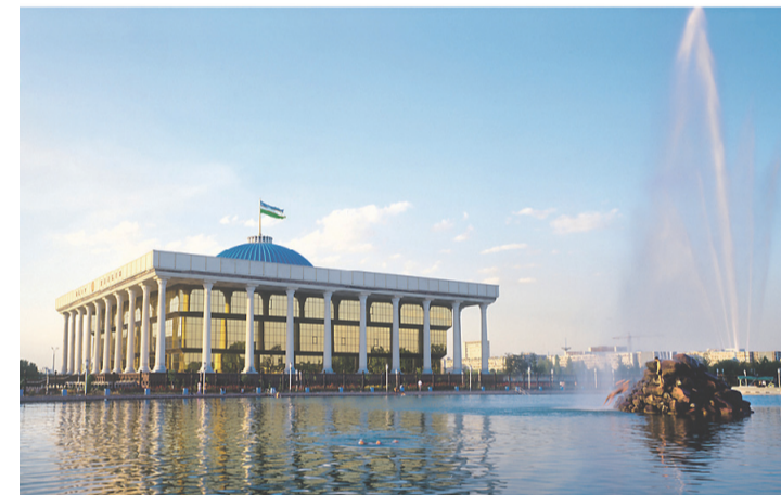
Oliy Majlis (the Supreme Assembly) is the parliament of Uzbekistan. EMBASSY OF UZBEKISTAN

stitutional article amendments, which provided step-by-step, continuous liberalization of the national election system, creating a bicameral parliament in accordance with the requirements of the law and internationally recognized principles and norms.