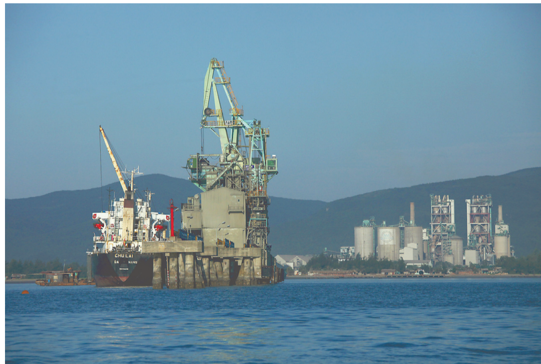
Nghi Son Refinery is the second planned oil refinery in Vietnam. Construction began in 2013 and operations are targeted for 2017. HOANG QUANG

Cooperation in culture, education, science and technology, as well as people-to-people exchanges and cooperation among localities of the two countries have been enhanced. There are over 15,000 Vietnamese students and researchers in Japan. In 2013, Vietnam received 600,000 tourists from Japan and 85,000 Vietnamese