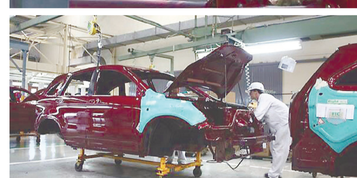
Above: Energy reforms in Mexico have opened the sector to private investment, creating a competitive and efficient energy market. Below: Mexico's automotive industry, a main sector for foreign investment, exemplifies a robust economy.

the 31st Japan-Mexico Businessmen's Joint Committee Meeting, which was hosted in Mexico City through the collaborative efforts of Keidanren and the Mexican Business Council for Foreign Trade, Investment and Technology (COMCE). At this meeting, the Mexican government and business community expressed their high hopes for greater cooperation with Japan in trade, investment and personnel exchange. We were delighted that President Peña Nieto attended the meeting, noted that increased investment in Mexico by Japanese companies has made a significant contribution to job creation and technological innovation in Mexico, and stat-