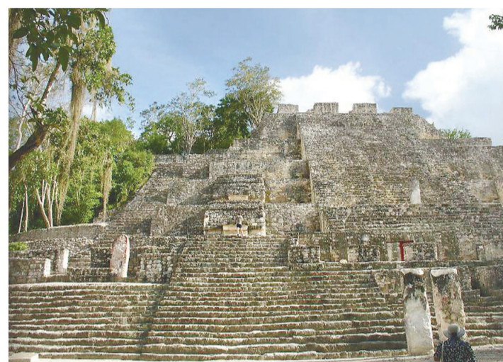
The ancient Mayan City and protected tropical forest of Calakmul, recognized by UNESCO as a mixed property on the World Heritage List, symbolizes the natural and cultural wealth of Mexico.

In July 2014, Prime Minister Abe paid an official visit to Mexico accompanied by important government and business leaders. In their summit meeting, the two leaders wel-