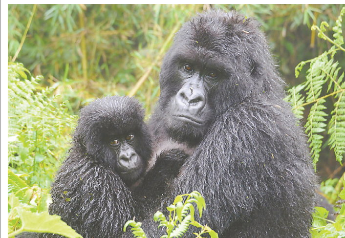
Uganda is home to half of the world's remaining mountain gorillas, which number in the 600s. EMBASSY OF UGANDA

(Official Authorized Toyota Distributor in Uganda) No. 1 First Street, P.O. Box 31732, Kampala, Uganda TEL: +256-414-349425 FAX: +256-414-346649 Web site: http://www.toyotaug.co.ug/