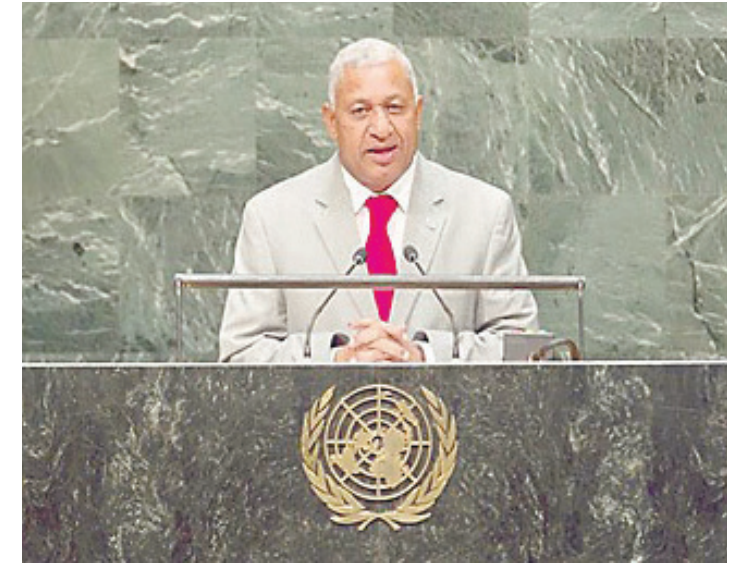
Fiji Prime Minister Josaia Voreqe Bainimarama delivers Fiji's national statement at the 69th session of the U.N. General Assembly on Sept. 27 in New York.

Fiji's commitment to being a good global citizen is manifested through its ongoing engagement with the United