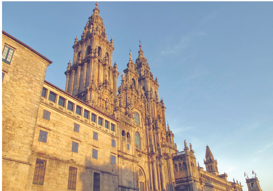
The Cathedral of Santiago de Compostela has been a place of pilgrimage on the Way of St. James since the Early Middle Ages.