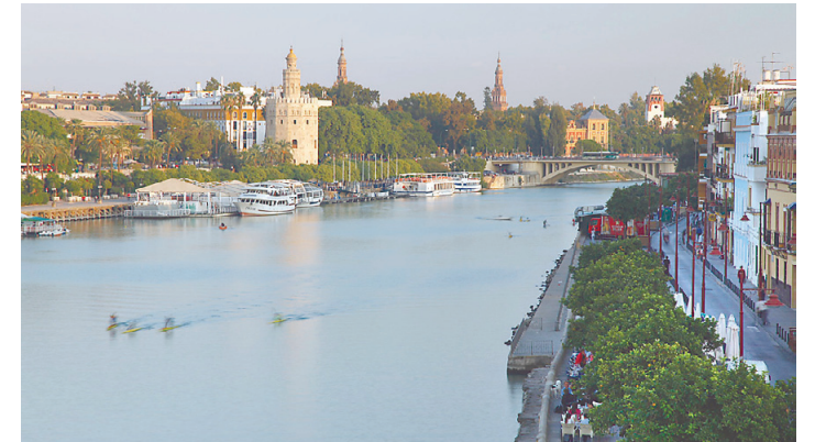
Situated on the Guadalquivir River, Seville is a major tourist destination and home to three UNESCO World Heritage sites.

With my appreciation to The Japan Times for publishing this message.