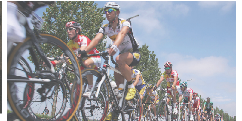
The annual "Ronde van Vlaanderen," or Tour of Flanders will take place on April 5 in 2015.

Flanders is an all-in cycling destination. For everyone from hard-core cyclists to passionate supporters, the "Cycling in Flanders" website ( http://cycling-in-flanders.com ) provides an all encompassing platform to discover Flanders' cycling culture, sharing the little-known secrets, including cycling paths and events.