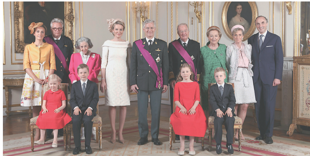
King Philippe (center) and Queen Mathilde, former King Albert (fourth right) and Queen Paola with Royal family members

Japan and the European Union also share the determination to build a strengthened relationship, the legal basis of which will be both the "Strategic Partnership Agreement"