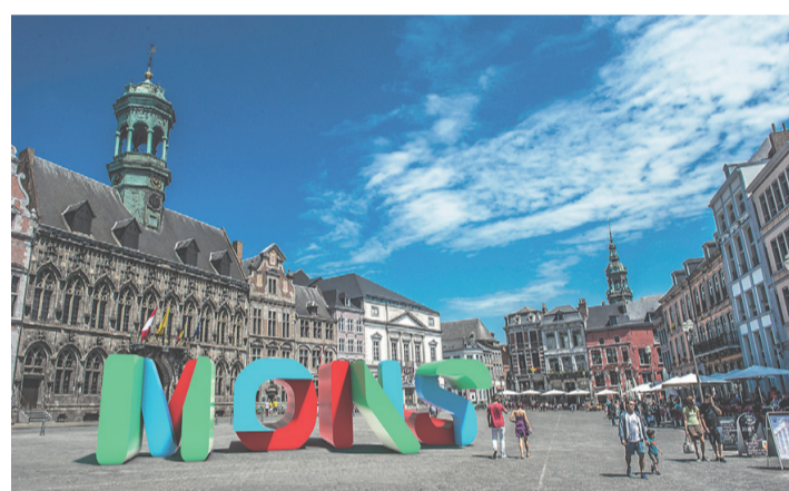
Grand Place (above) and the belfry in the city of Mons

Many events will take place in 2015 such as the "Van Gogh in the Borinage, the birth of an artist" exhibition. During his stay of almost two years in Mons, Van Gogh ended his career as a clergyman by choosing the life of an artist (Jan. 24 to May 17). Also, the "Verlaine,