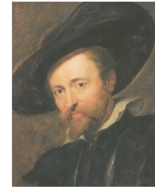
Self-portrait by Peter Paul Rubens ANTWERPEN RUBENSHUIS COLLECTIEBELEID

Organized by the cathedral and the Royal Museum of Fine Arts Antwerp, eight monumental altarpieces painted and carved by celebrated masters