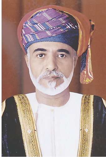
His Majesty Sultan Qaboos bin Said

Prime Minister Abe visited Oman in January and met with H.M. Sultan Qaboos bin Said.