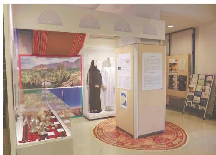
The Omani Corner at Komaba Museum, a permanent exhibition of Omani culture, opens in the University of Tokyo on Sept. 29.