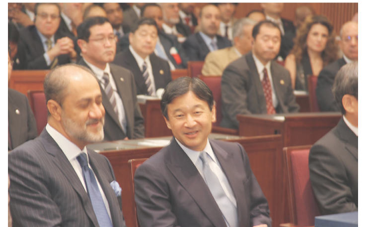
Omani Minister of Heritage and Culture H.H. Sayyid Haitham bin Tariq Al Said (left) and H.I.H. Crown Prince Naruhito attend the third Sultan Qaboos Scientific Chairs Symposium on Oct. 2 at the University of Tokyo.

teem, both as a leadership and as a state. Oman's benign efforts and endeavors succeeded many times in rapprochement of views and overcoming disputes between states in the region and beyond. This earned Oman more respect at all levels.