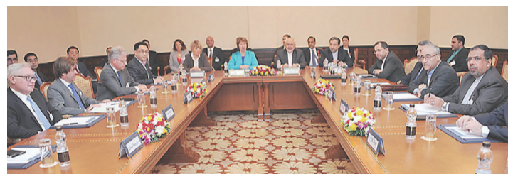
The ninth round of talks among Iran and P5+1 (U.S., Russia, China, France, U.K. and Germany) toward a comprehensive agreement on the Iranian nuclear program takes place on Oct. 11 in Muscat.