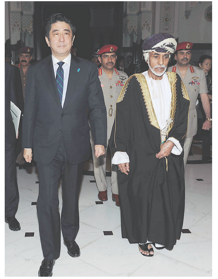
H.M. Sultan Qaboos bin Said welcomes Prime Minister Shinzo Abe in Muscat on Jan. 9.

On Oct. 23 and 24 Tokyo hosted the Oman Investment Forum, which saw the participation of more than 200 representatives of corporations and government agencies from both countries. Omani delegates presented Oman's economic diversification plans and the various developmental and infrastructure projects taking place, and discussed with