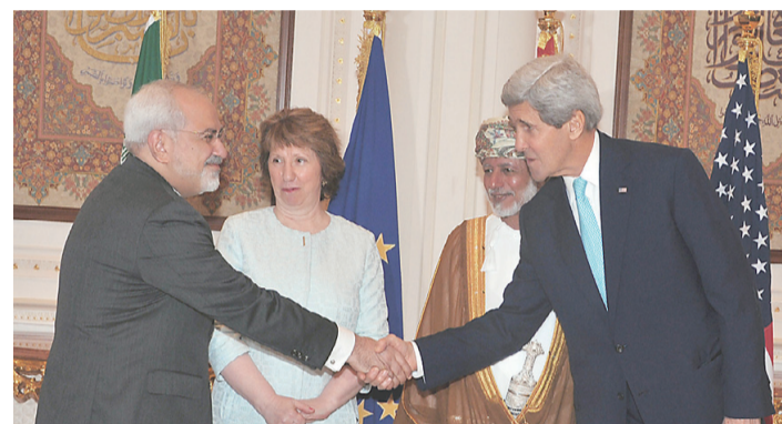
From left, Iranian Foreign Minister Mohammad Javad Zarif; EU representative Catherine Ashton; Omani Minister Responsible for Foreign Affairs Yusuf bin Alawi bin Abdullah; and U.S. Secretary of State John Kerry share greetings before the trilateral meeting on Iran's nuclear program held in Muscat on Oct. 9 and 10.

On the grounds of this clear and deep vision, Oman established its relations with other