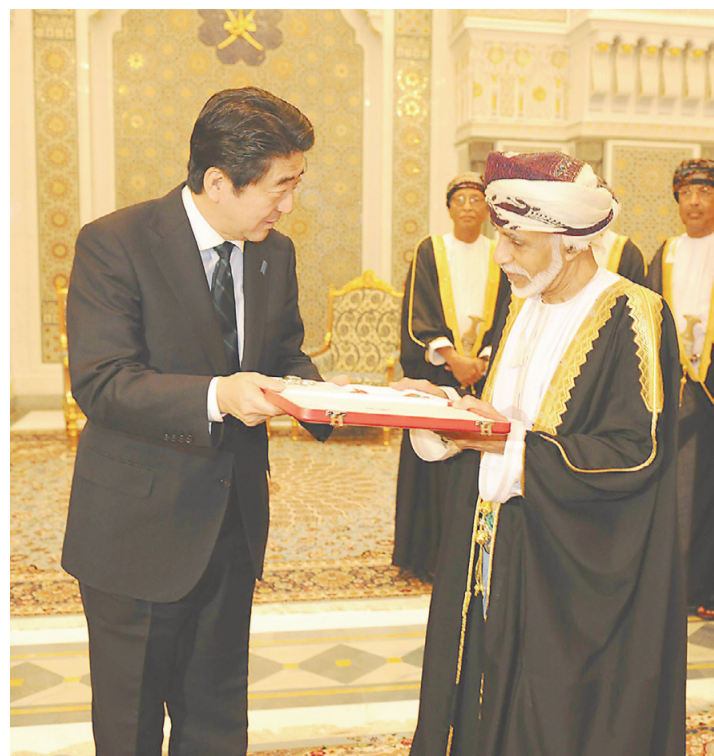
H.M. Sultan Qaboos confers the Oman Civil Order "Second Class" on Prime Minister Shinzo Abe at the Baraka Palace in Muscat on Jan. 9. EMBASSY OF THE SULTANATE OF OMAN