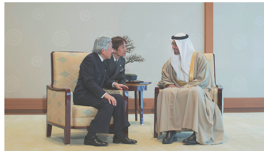
Clockwise from top, H.H. Sheikh Mohammed meets with Emperor Akihito in Tokyo in February; H.H. Sheikh Mohammed shakes hands with Prime Minister Shinzo Abe during the same visit; the Sheikh Zayed Grand Mosque, one of the most prominent and beautiful architectural monuments in the world

Finally, I wish for many more years of progress and prosperity between our two countries.