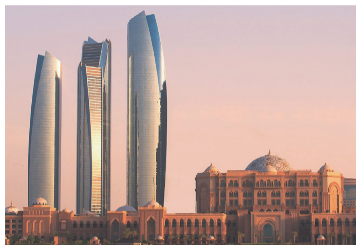
Etihad Towers: A spectacular five-tower development and Emirates Palace (right) EMBASSY OF THE UAE

The Japan-UAE Society is determined to further enhance mutual understanding and amicable relations between the two countries by deepening exchanges. I heartily pray for prosperity of the UAE and a closer bilateral relationship.