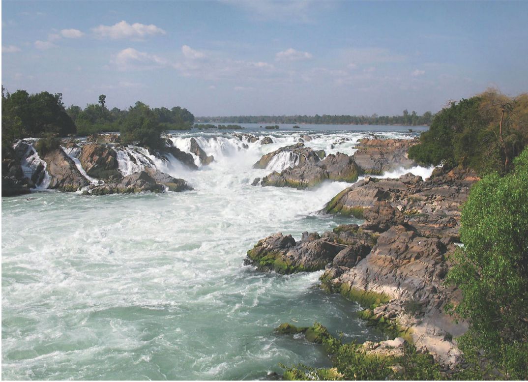
The Khone Phapheng Waterfall on the Mekong River is the largest waterfall by volume in Southeast Asia, located in southern Champasak province of Laos. The waterfall is called Tad in the Lao language. EMBASSY OF LAOS