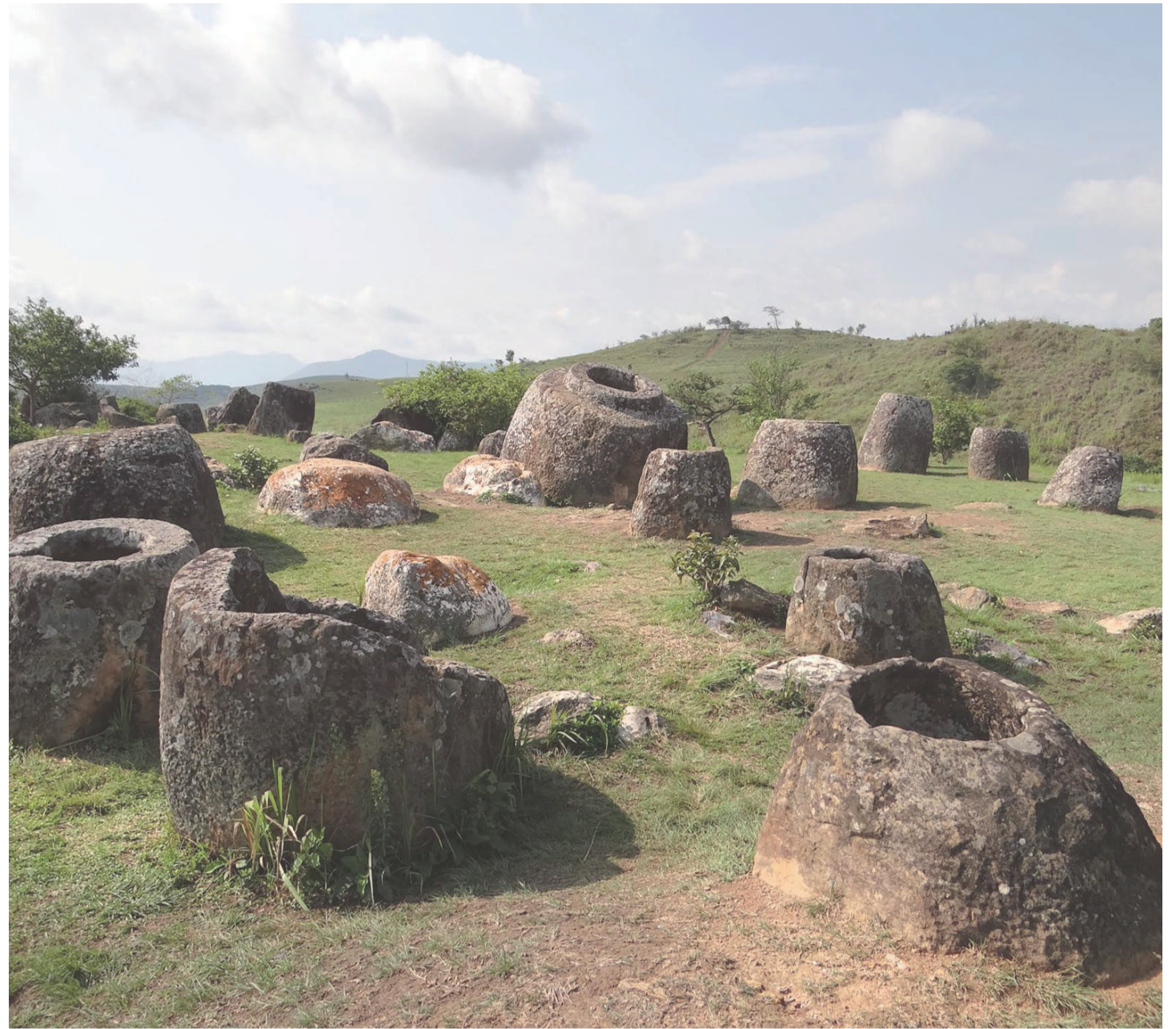
Clockwise from top left, a symbol of Laos in Vientiane, the That Luang Stupa was built over an ancient stupa in the 16th century by King Setthathirath; The Plain of Jars, prehistoric stone megaliths, attracts thousands of tourists to the northern Xieng Khouang province of Laos; Prime Minister Shinzo Abe welcomes H.E. Thongsing Thammavong, prime minister of the Lao PDR in Tokyo on Dec. 15, 2013.

friendship and cooperation between our two countries. In 2000, former Prime Minister of Japan Keizo Obuchi paid an official visit to Laos. The Laos-Japan relations have been nurtured and developed gradually and reached the level of Comprehensive Partnership for Peace and Prosperity in 2010 on the occasion of the official visit to Japan by H.E. Choummaly Sayasone, presi-