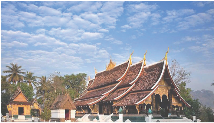
Top, since 2007, the annual Elephant Festival, celebrates Laos' history as "The Land of Million Elephants" in mid-February in the northern province of Sayabouly, attracting more than 80,000 elephant fans to the ceremonies, parades and performances. Bottom, Wat Xiengthong or Xiengthong Temple, a major attraction in the northern province of Luang Prabang, has been a UNESCO World Heritage site since 1995.