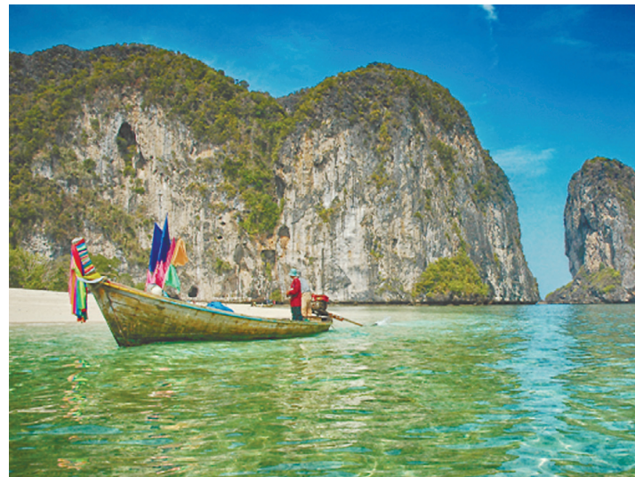
Left, Krabi is a popular beach destination in southern Thailand. Right, Red Lotus Lake is one of the most fascinating scenes that can be witnessed in Udorn Thani in northeastern Thailand.