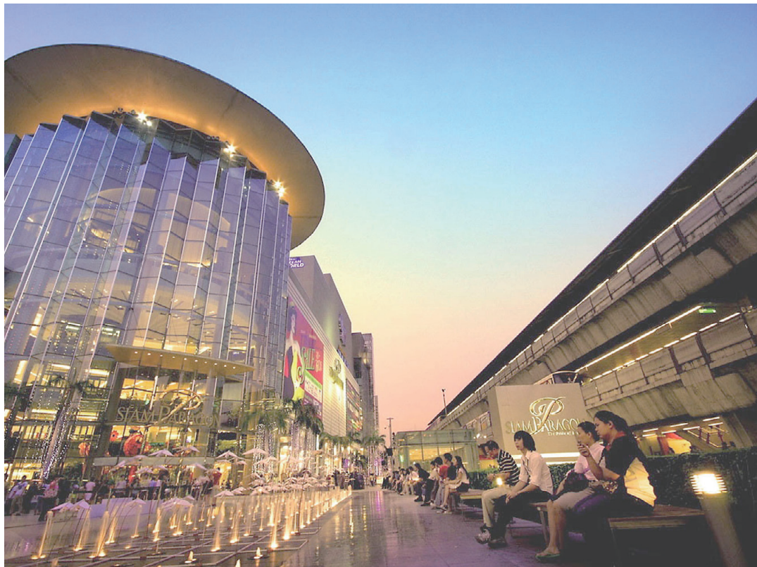
Opened in 2005, Bangkok's Siam Paragon shopping mall is one of the biggest shopping centers in Asia.

For people-to-people exchanges, since implementing the short-term visa exemption for Thai tourists in July 2013, the number of Thai tourists who visited Japan in 2013 dramatically increased by 74 percent to 453,600 people. In the first half of 2014, the Thai tourists coming to Japan increased