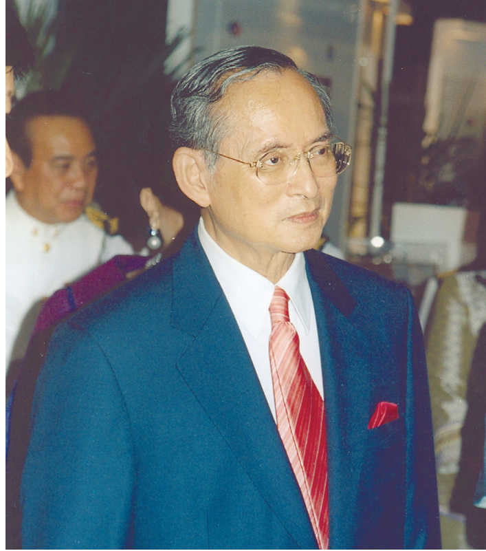
His Majesty King Bhumibol Adulyadej of Thailand

Beyond national boundaries, His Majesty's contributions have been recognized in a multitude of honors, including more than 30 international awards and more than 20 honorary degrees. In 2006, the United Nations awarded him the first United Nations Development Programme (UNDP) Human Development Lifetime Achievement Award. According to the citation, it was "for his dedication to develop and industriously uplift the living condition of Thai people all through his 60-year reign." In 2009, the World Intellectual