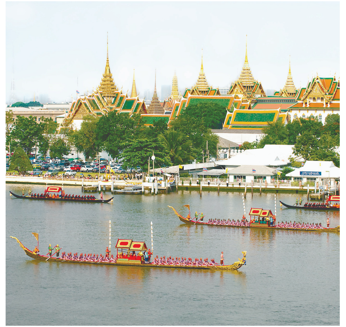
Thailand's Royal Barge Procession is a ceremony of both religious and royal significance. Proceeding down the Chao Phraya River from the Wasukri Royal Landing Place in Khet Dusit, Bangkok, the procession passes the Temple of the Emerald Buddha, the Grand Palace, Wat Pho and finally arrives at Wat Arun. EMBASSY OF THAILAND