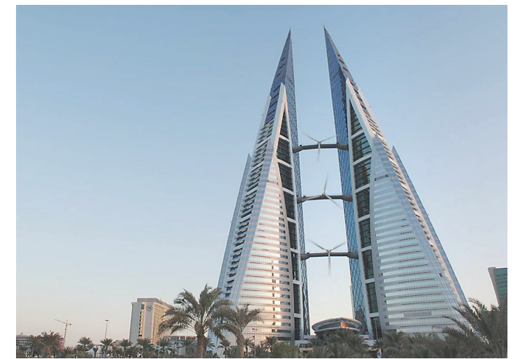
Bahrain World Trade Center EMBASSY OF BAHRAIN

To conclude, I wish the best of continuous prosperity and happiness to Their Imperial Majesties the Emperor and Empress as well as the country of Japan and its people, ongoing progress in all fields for both countries and the continuance of the special relationship tying our nations.