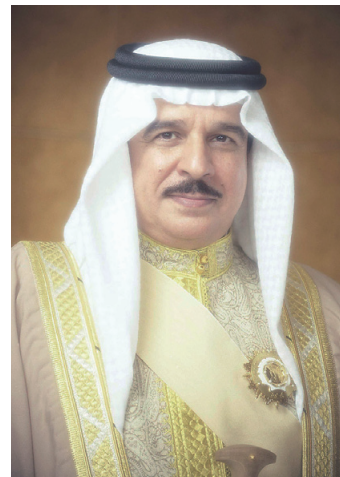
His Majesty King Hamad bin Isa Al Khalifa of Bahrain

For most of the Japanese people staying in the Arabian Gulf,