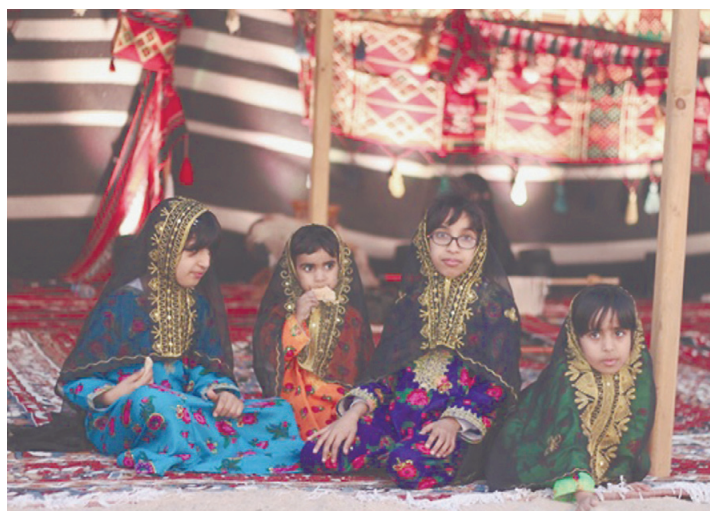
Children wearing traditional clothing during Qatar National Day celebrations

On Nov. 6, the eighth meeting of the Qatar-Japan Joint Economic Committee was held in Tokyo. H.E. Mohammed Saleh Al-Sada, minister of energy and industry, and other government officials represented the Qatari side, while H.E. Yoichi Miyazawa, minister of economy, trade and industry, H.E. Yasuhide Nakayama, state minister for foreign affairs and other government officials represented the Japanese side. Both sides reviewed the latest update on the development of bilateral cooperation toward a "Comprehensive Partnership," and discussed the possibility of further accumulating tangible cooperation in a wide range of fields, including energy and business.