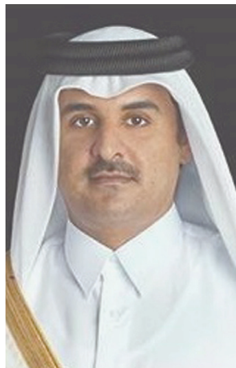
H.H. Emir Sheikh Tamim Bin Hamad Al-Thani of the State of Qatar

Thanks to the clear vision and the strong commitment of H.H. Sheikh Tamim Bin Hamad Al-Thani, emir of the State of Qatar, our country has been able, within a short period of time, to make remarkable advancements in terms of economic and social development. The wisdom of our leadership and the loyalty of our