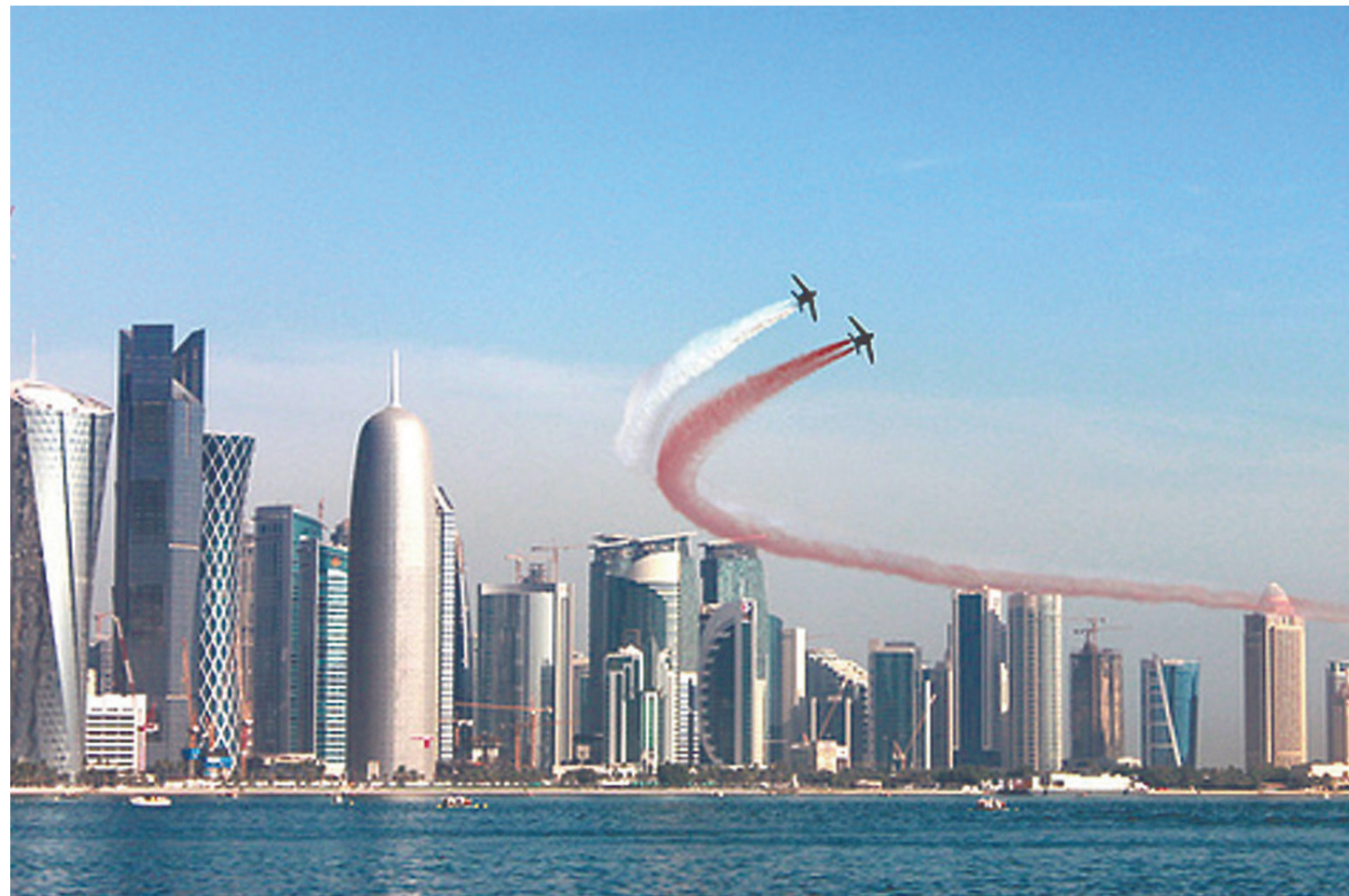
Qatar air force planes and soldiers on camels take part in festivities celebrating Qatar National Day.

Channels of bilateral consultation and dialogue at all levels on economic, political and security issues have been reinforced. In June, our countries launched the first round