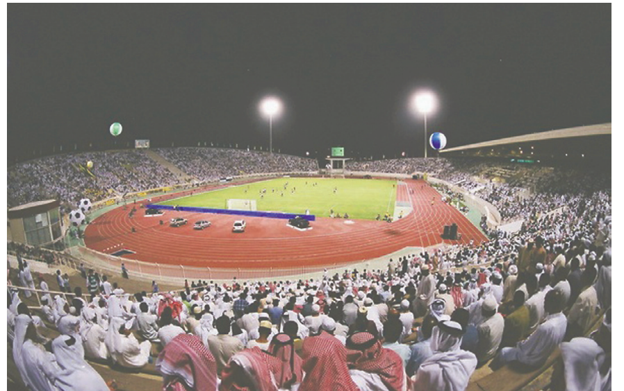
Clockwise from above, Desert adventures in a camel caravan; the Museum of Islamic Art in Qatar; exciting soccer games; handicrafts at the newly restored traditional-style Souq Waqif market are just some of the attractions that Qatar offers to tourists from around the world.