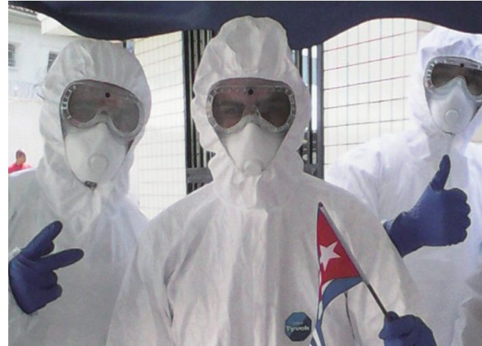
Above, Cuban health care workers are working in Sierra Leone, a country that is severely affected by Ebola; right, El Capitolio, or the National Capitol Building in Havana was the seat of government until the Cuban Revolution triumphed in 1959, now houses a museum.

Dialogue with society, especially the direct participation of the entire Cuban population in the decision-making process,