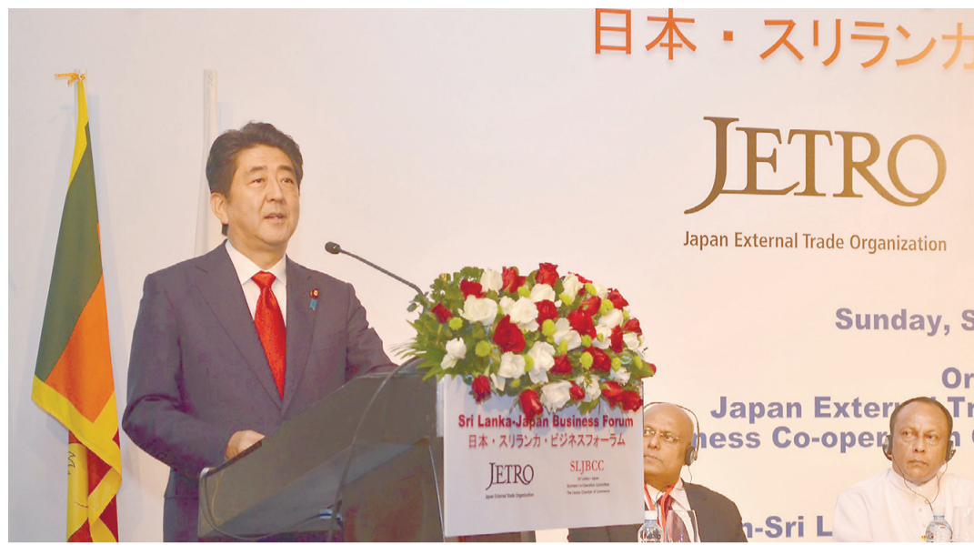
Prime Minister Shinzo Abe addresses the closing session of the Sri Lanka-Japan Business Forum on Sept. 7 in Colombo, Sri Lanka.

The year 2014 was unique for both countries as Japanese Prime Minister H.E. Shinzo Abe undertook a two-day official visit to Sri Lanka. The last occasion a prime minister of Japan visited Sri Lanka was in 1990. During this visit, Abe had several high-level meetings, including that of a high profile business forum. In July, the Vice President of the ruling Liberal Democratic Party, Hon. Masahiko Komura, who is also the president of Japan-Sri Lanka Parliamentary League, visited Sri Lanka with a number of parliamentarians from the league,