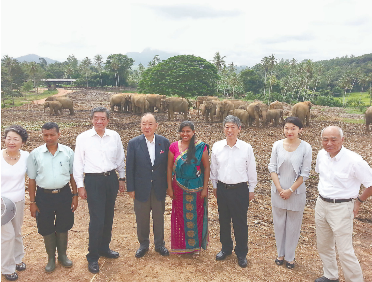
Members of the Japan-Sri Lanka Parliamentary Friendship League visit the Pinnawala Elephant Orphanage in Sri Lanka in July 2014.