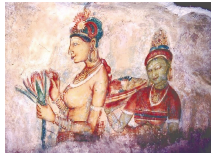
Ancient frescoes at the ruins of Sigiriya, a UNESCO World Heritage site, depict women known as "Sigiriya Ladies."

On the occasion of our national day, let us all collectively rededicate ourselves to building a new multicultural Sri Lanka where freedom, equality and justice prevail for all.