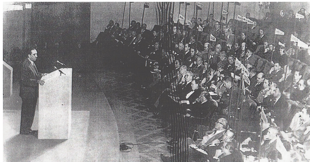
J.R. Jayawardene, then finance minister and later president of Sri Lanka, speaks at the San Francisco Peace Conference on Sept. 6, 1951.