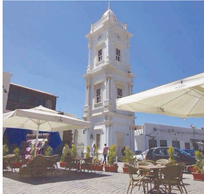
The Old City and Algeria Square (right) in Tripoli EMBASSY OF LIBYA

The history of diplomatic relations between our two countries dates back to 1957,