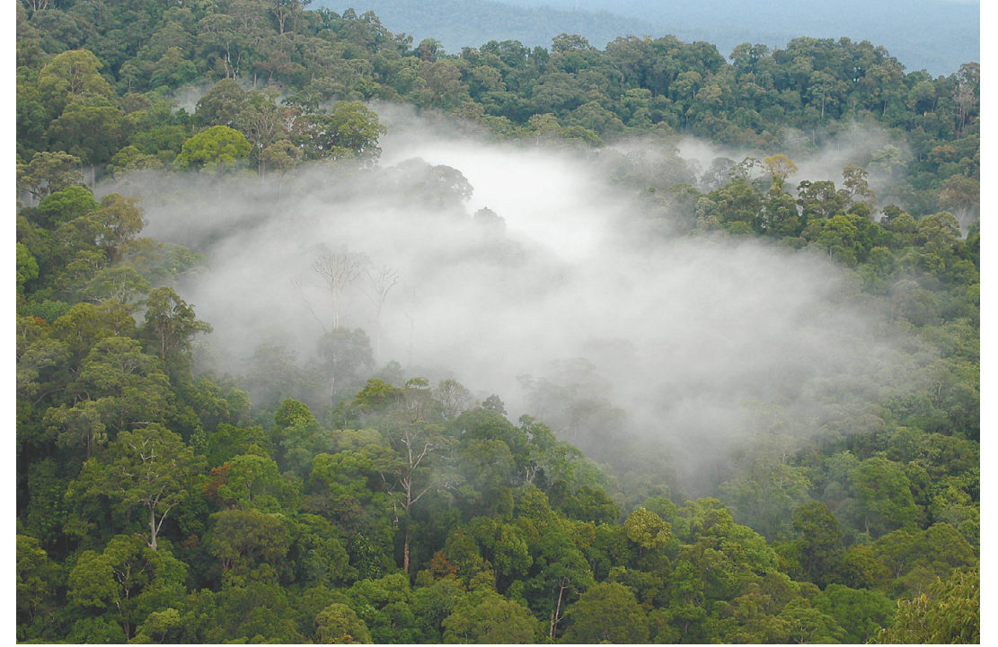
Ulu Temburong National Park in eastern Brunei contains unspoiled jungle and is known as the "Green Jewel of Brunei."

Several youth exchange programmes have also been designed, not only to enhance our people-to-people contacts, but also to improve our youth's understanding of the different cultures and traditions around the world. It is pleasing to note that Japan has been an active partner in this field, with