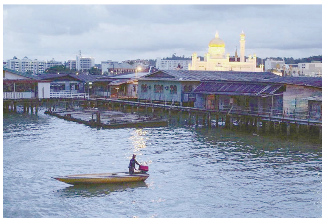
The Kampong Ayer, an area of Brunei's capital city Bandar Seri Begawan that is situated over Brunei Bay, is one of the largest water village in the world.

Hello, we are Bru-Bru & Nei-Nei. Would you like to come to Brunei with us? Brunei Darussalam is one of the friendliest countries in the world. Please come and share in the tenderness that will support your happiness.