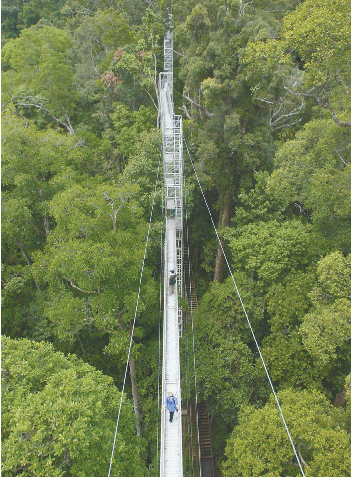
Tourists can enjoy the Canopy Walkway in Ulu Temburong National Park.