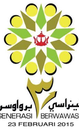
Brunei 31st National Day logo EMBASSY OF BRUNEI

For our 31st National Day, Brunei Darussalam has once again adopted the theme of "Generasi Berwawasan," or "Generation with Vision," which reflects the government and people of Brunei Darussalam's ongoing commitment to achieving "Vision 2035." Since achieving independence in 1984, the government of Brunei Darussalam has made many endeavours to ensure the prosperity of the people and country and we hope that by 2035, we will be recognised