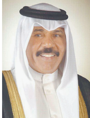
Crown Prince of the State of Kuwait Sheikh Nawaf Al-Ahmad Al-Jaber Al-Sabah

In fact, the State of Kuwait has taken several necessary steps to help Japanese investors find favorable grounds to invest in the country and to benefit from our government's ambitious National Development Plan. Among these steps,