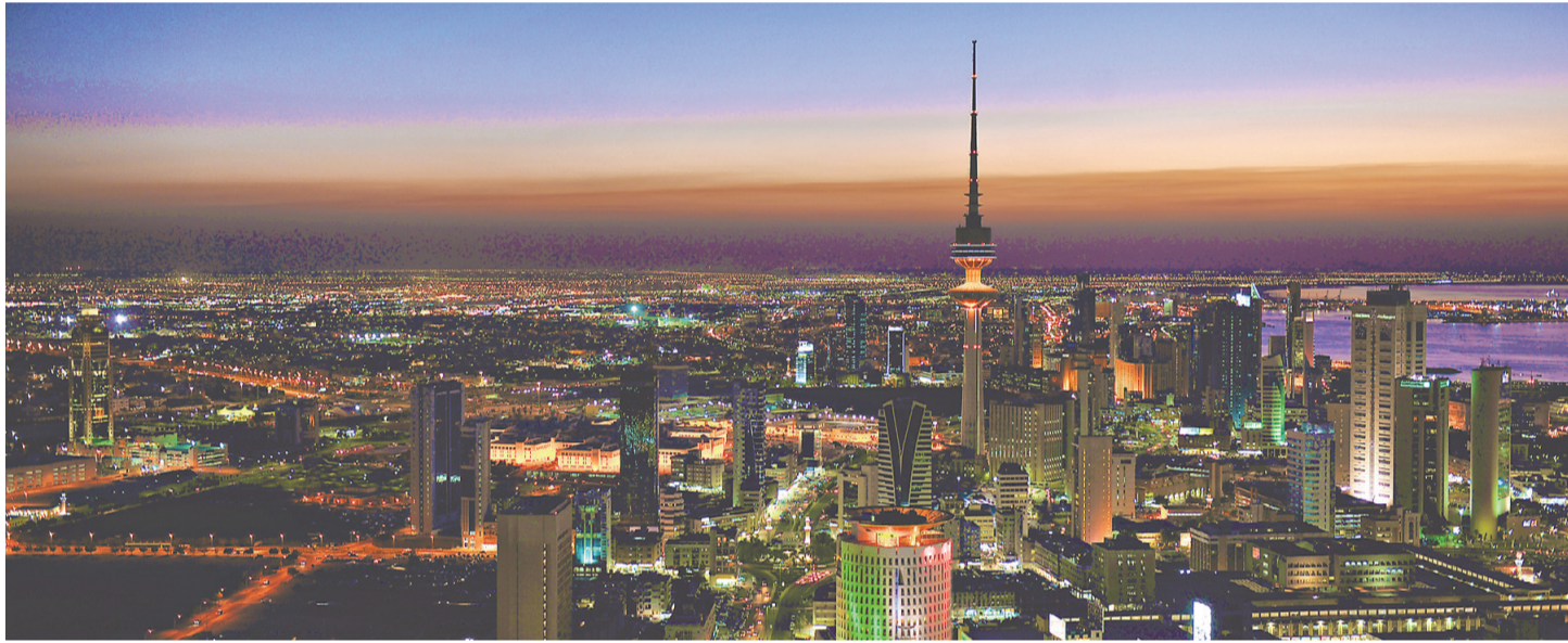
Liberation Tower rises above the skyline of Kuwait City.