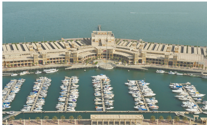
Skyscrapers (right) and the Souq Sharq Mall are among the major attractions in Kuwait.

Furthermore, the State of Kuwait has rushed to the relief of countries devastated by natural disasters such as Bangla-