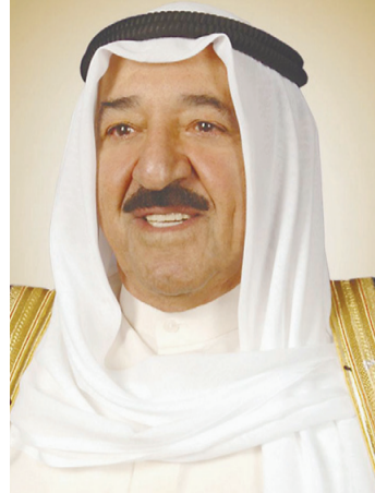
Amir of the State of Kuwait Sheikh Sabah Al-Ahmad Al-Jaber Al-Sabah

easing the requirements of the offset program that was a stumbling block not just to Japanese companies, but also to other international companies as well. Kuwait also eased the tendering procedures for megaprojects. Moreover, in order to promote foreign investments in the State of Kuwait, the government established the Kuwait Direct Investment Promotion Authority under Law 116/2013. Its goal is improving the over-