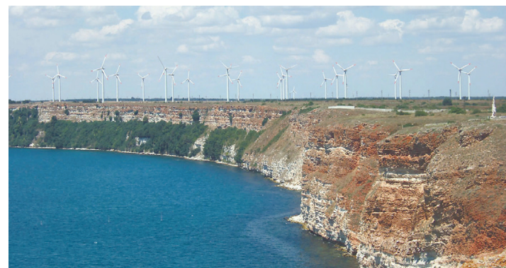
Mitsubishi Heavy Industries' Kaliakra Wind Power Station in Bulgaria is the biggest of its kind on the Balkan Peninsula.

Finally, I wish the Republic of Bulgaria continued success and prosperity.