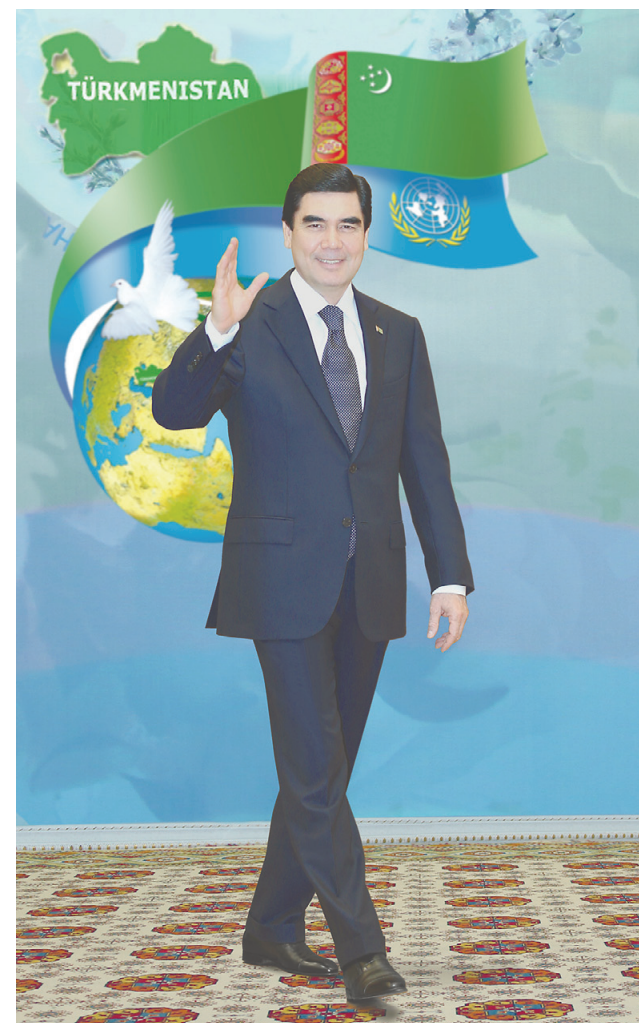
President of Turkmenistan Gurbanguly Berdimuhamedov

Text provided by the Embassy of Turkmenistan