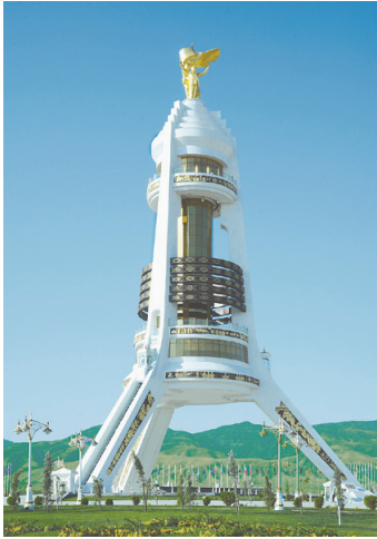
Monument of Neutrality in Ashgabat, the capital of Turkmenistan EMBASSY OF TURKMENISTAN

• Ensuring security through political and diplomatic means;