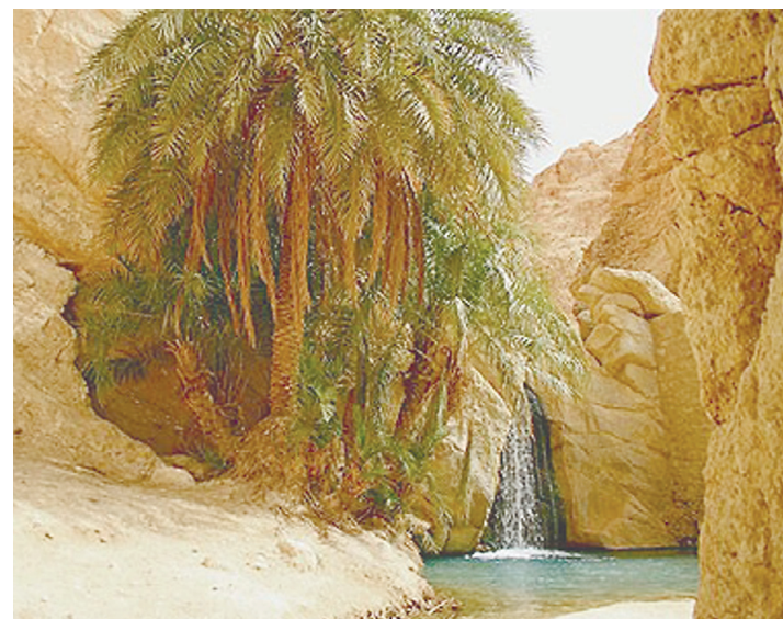
Located in Tozeur in the south of Tunisia, Chebika is a mountain oasis that houses a picturesque fountain and waterfall with palm trees below an old Berber village.

I am convinced that our relationship with the city of Nabeul and the Republic of Tunisia has promoted friendship and mutual understanding between the people of our countries. I would like to extend my sincere wishes for the further reinforcement of the friendly relations and the prosperity of the people of Tunisia.