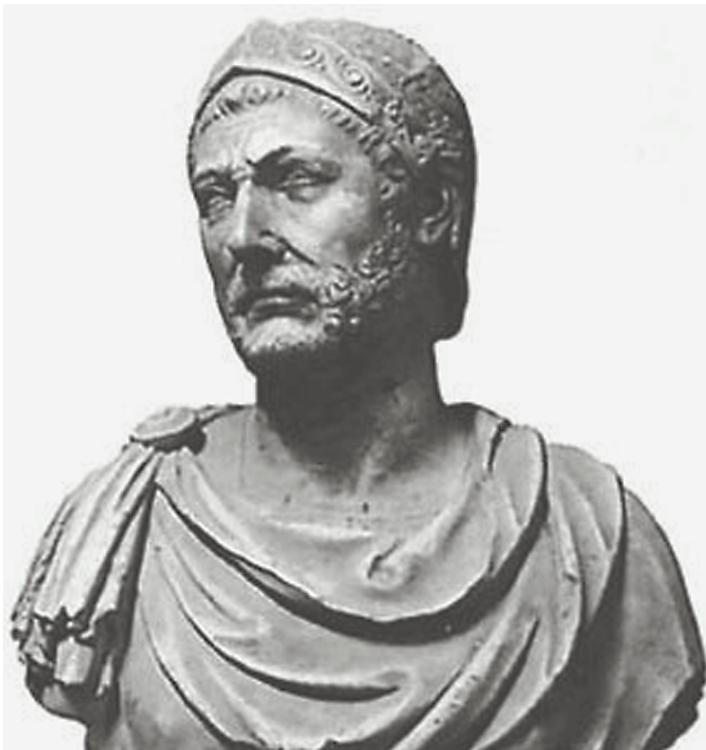
A marble bust of Hannibal the Punic Carthaginian military commander.

Following the legislative and presidential elections, H.E. Beji Caid Essebsi took office as the president of the Republic of Tunisia on Dec. 31, 2014, and a new government, headed by H.E. Habib