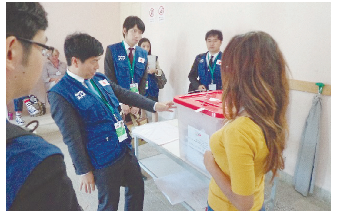
A delegation of Japanese observers led by Parliamentary Vice-Minister for Foreign Affairs Kazuyuki Nakane (second from left), oversees Tunisian elections on Oct. 26.